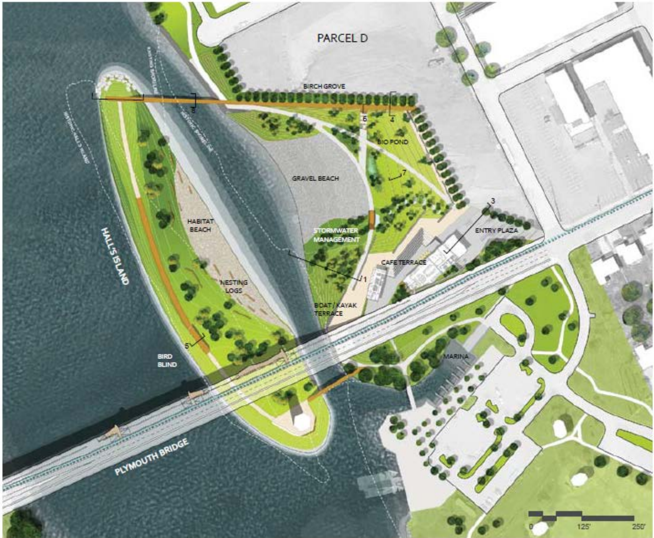
Figure 4: Hall's Island Design Concept

The exact configuration of Hall's Island will depend on hydrologic modeling. It is important to maintain the integrity of the island while also allowing adequate current to de-sediment the channel between the island and the future Scherer Park. The master plan amendment indicates that extensive study will take place to determine the best shape of the island, in order to provide this hydrologic function and augment habitat both on the island and in the river at all flood stages.