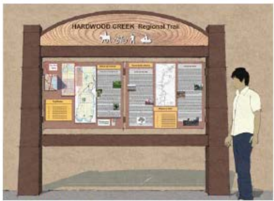
Example of kiosk concept and signage for Washington County trails. (Artwork provided by Washington County)