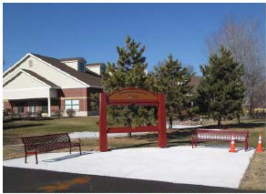
Hardwood Creek kiosk and rest stop.