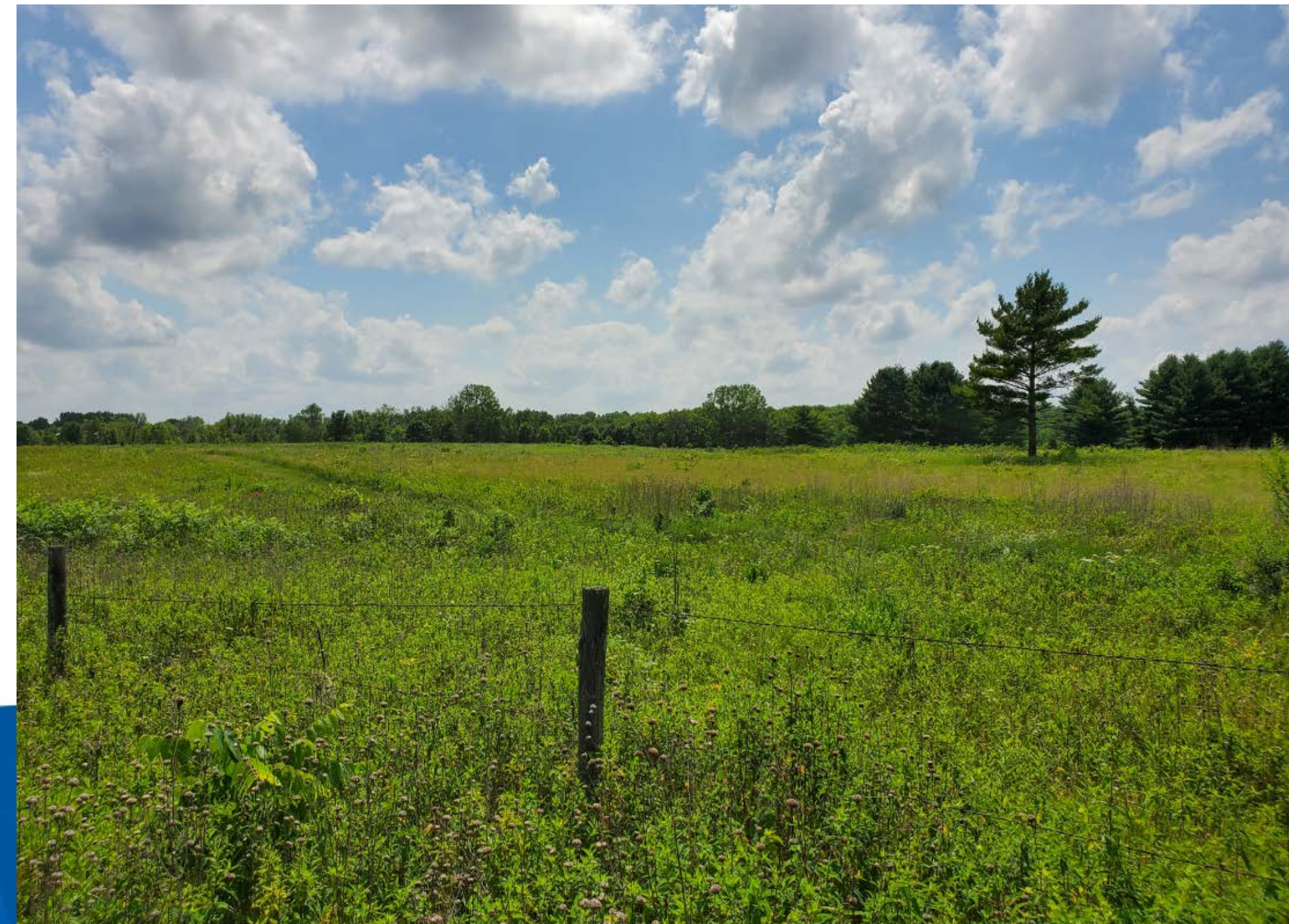
Bald Eagle-Otter Lake Regional Park