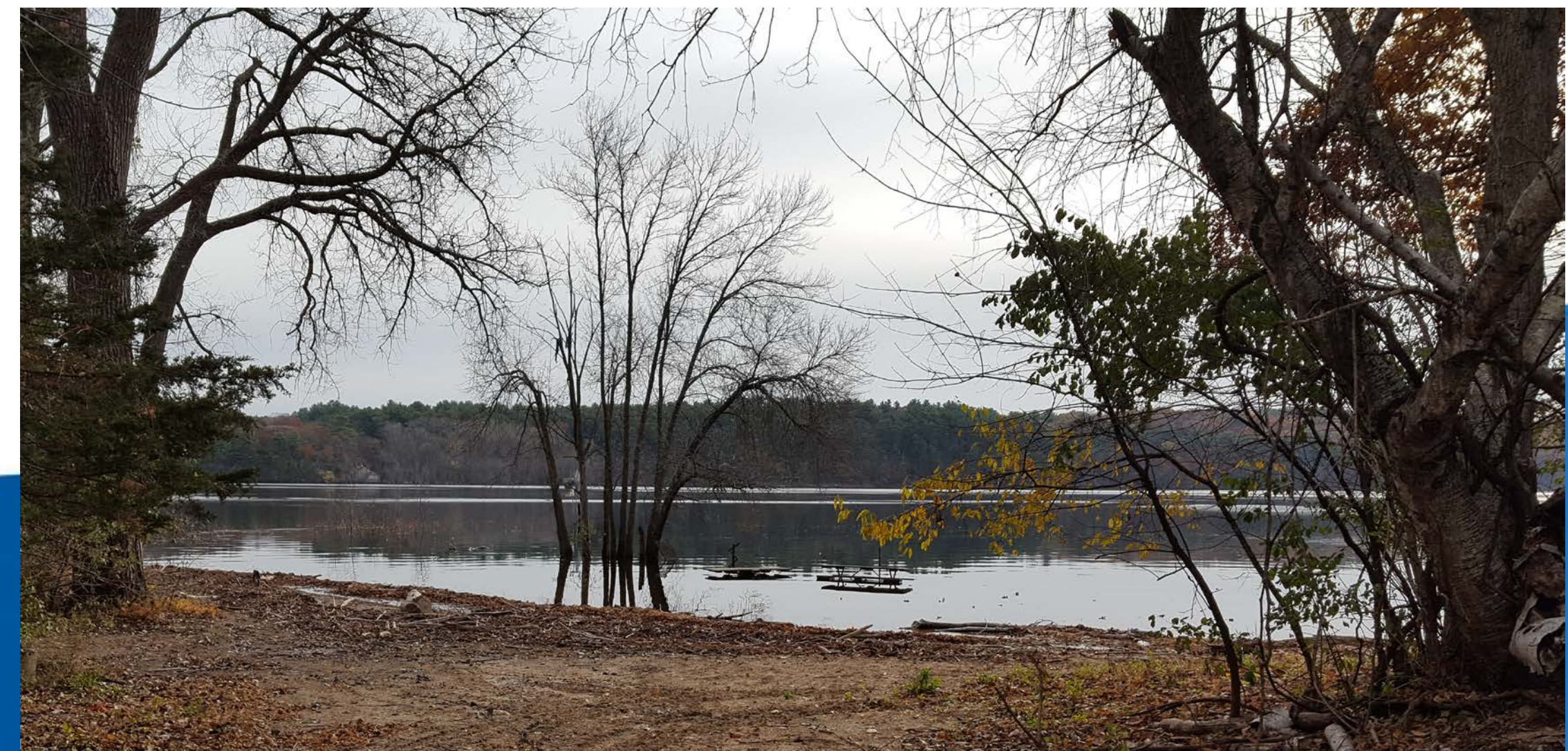
St. Croix Bluffs Regional Park Rowe acquisition