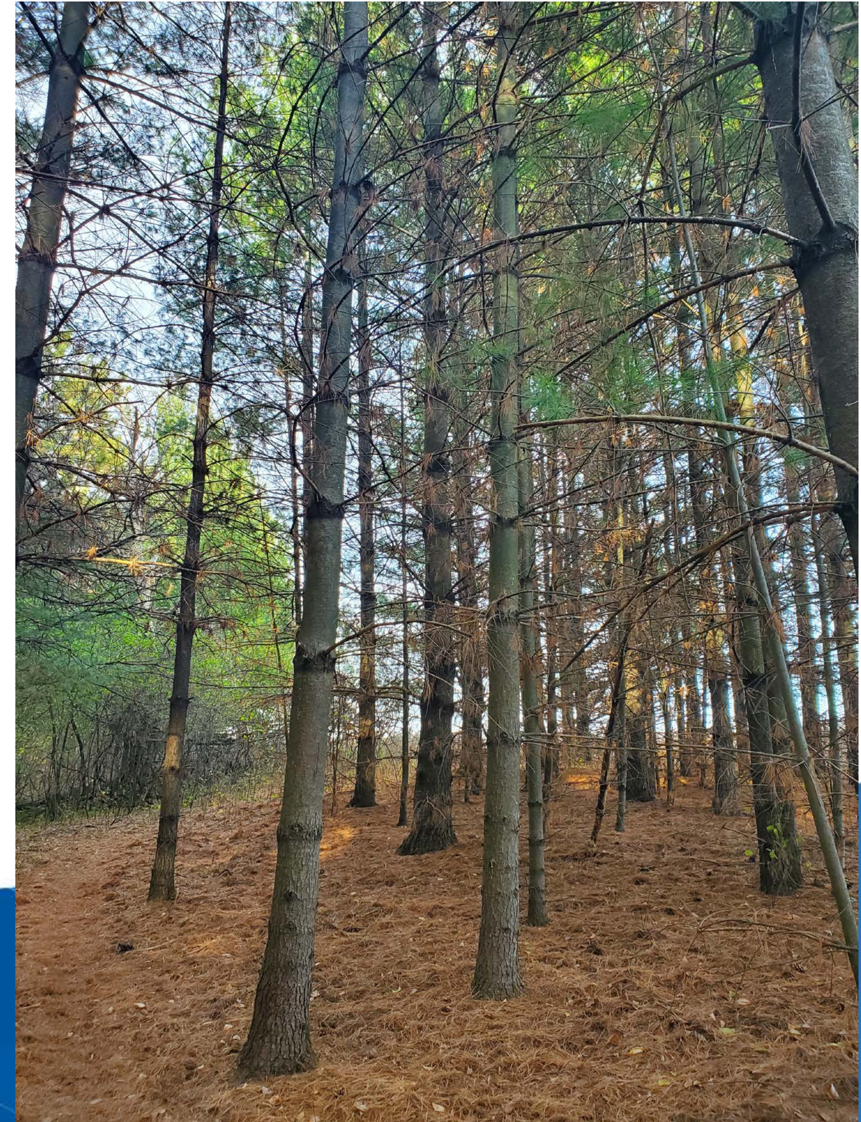
Pine Point Regional Park