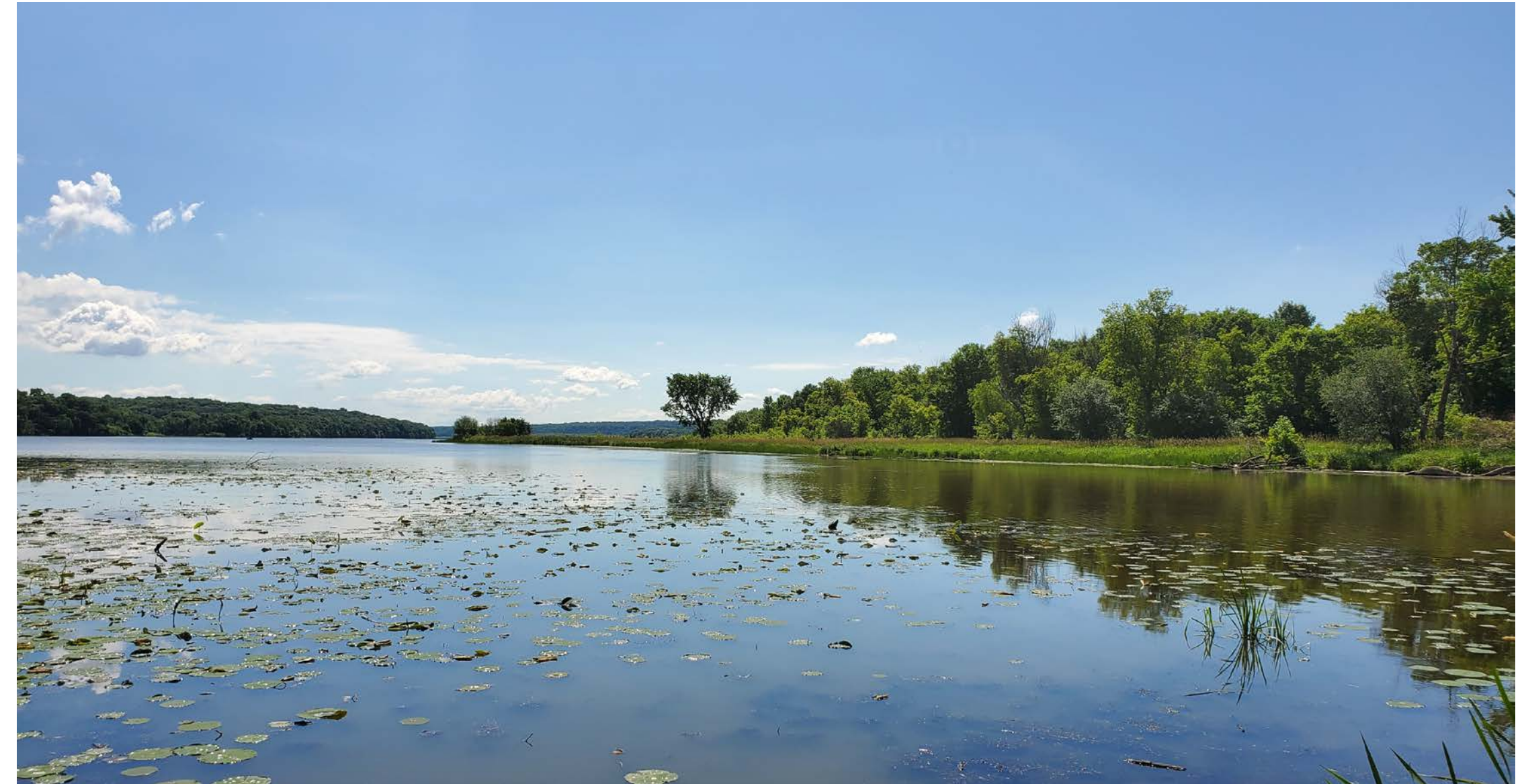
Grey Cloud Island Regional Park from a distance