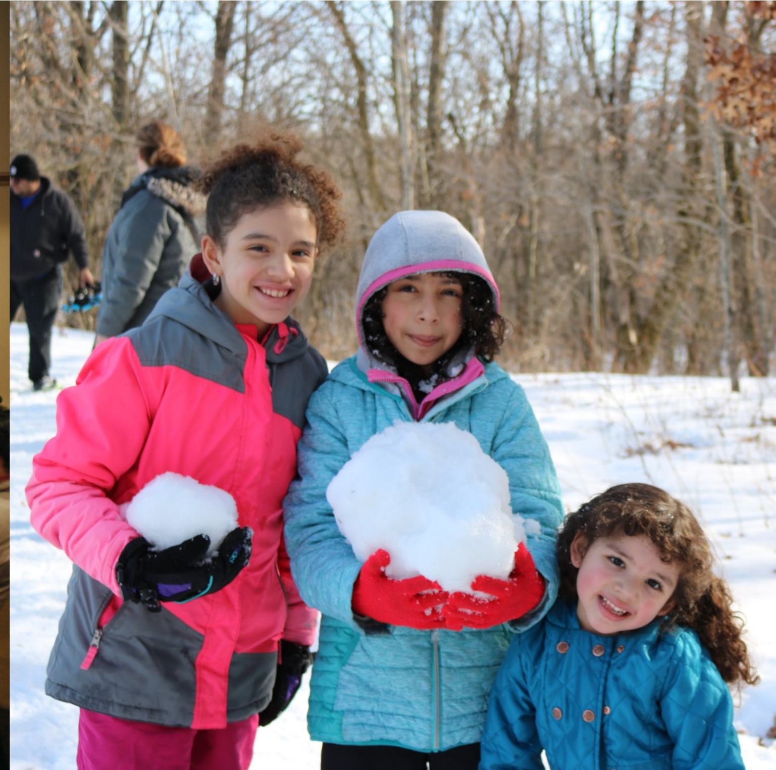
Dakota County Parks Outreach & Engagement Coordinator