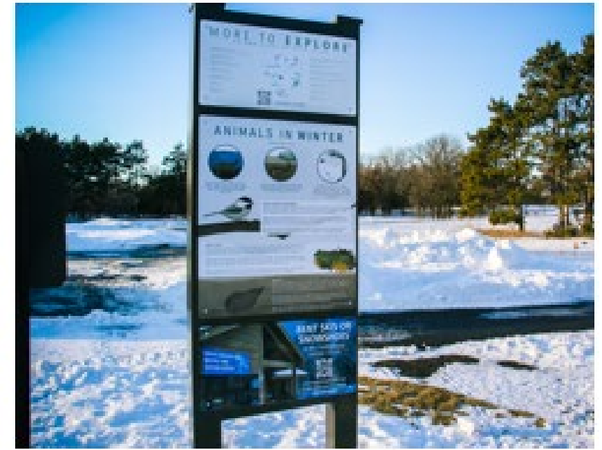
Engagement while in the parks