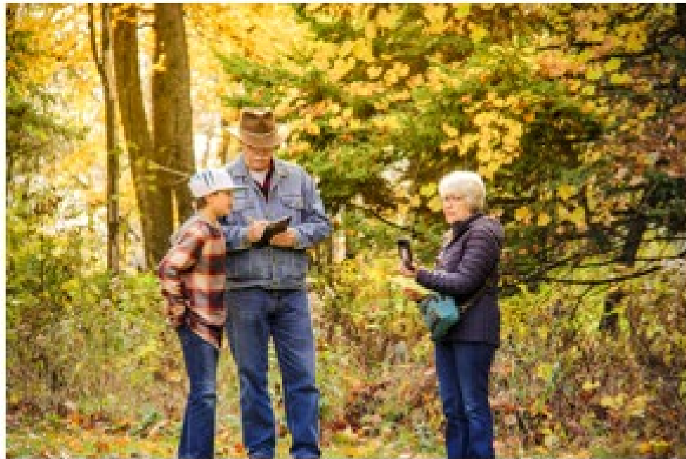
Ensured access to facilities and amenities

Input has shown people want easy access to parks, inclusivity and engagement with natural world.