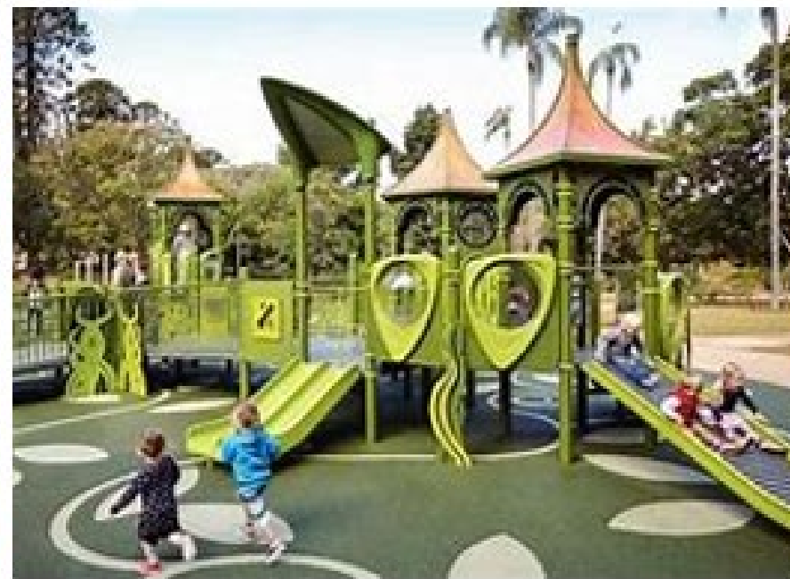
Inclusive destination playground