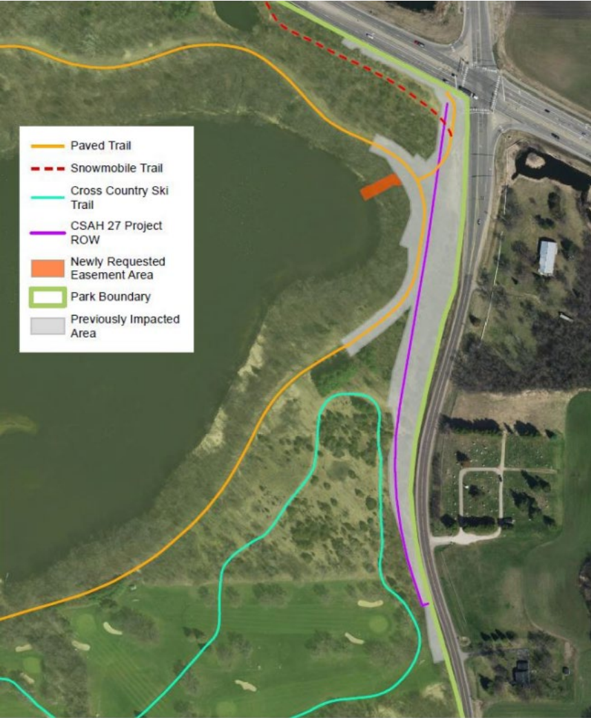
Three Rivers Park District's Clear Lake Regional Park Land Conversion