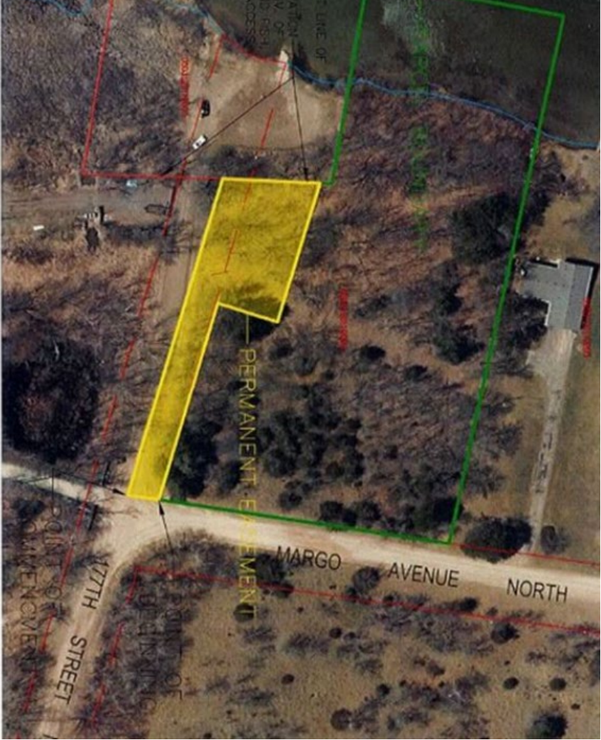
Washington County's Big Marine Park Reserve Drainage Easement