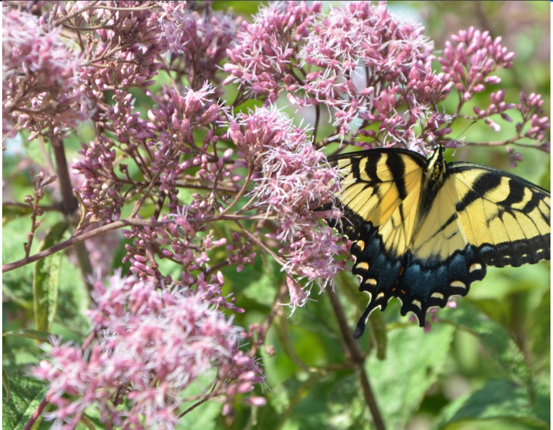
A swallowtail butterfly on joe pye weed plant.