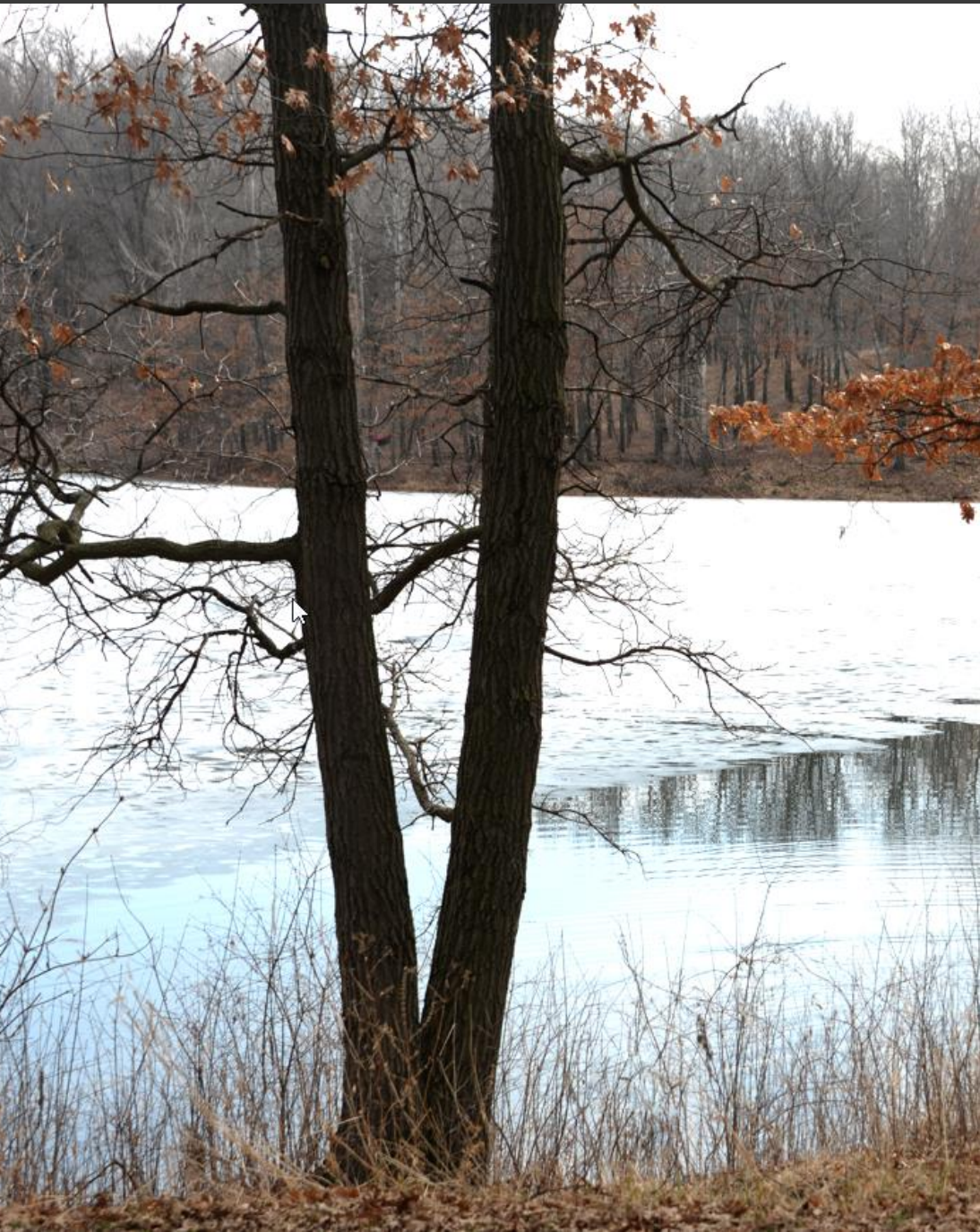
A Lebanon Hills Regional Park.