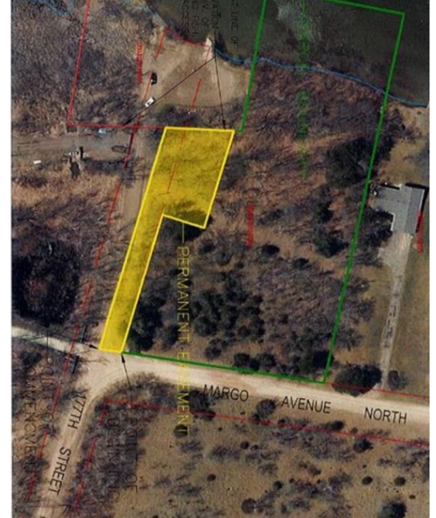
Washington County's Big Marine Park Reserve Drainage Easement