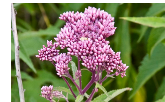
Spotted Joe Pye Weed