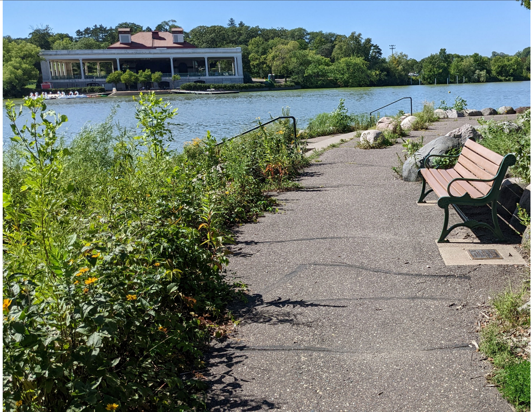
Lakeside Pavilion at Como Regional Park