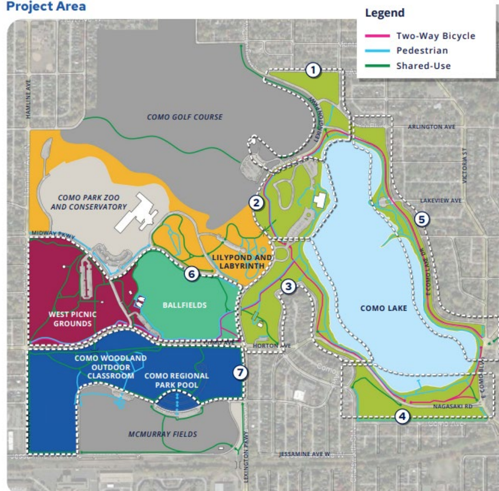
Fig. 4-21 | Overall Park Map