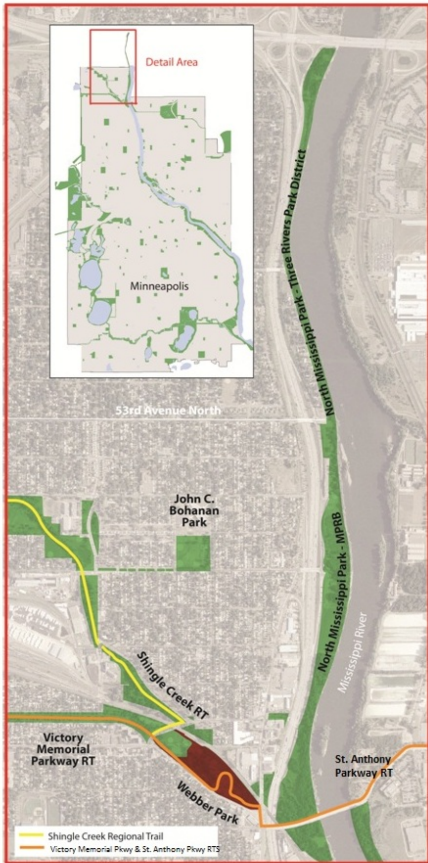
Figure 1: North Mississippi Regional Park Boundary and Expansion Area

Figure 1 shows the boundary of North Mississippi Regional Park; the portion of Webber Park being added to the boundary is shown in brown.