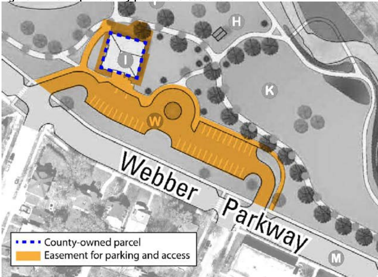
Figure 2: Hennepin County parcel and easement

Figure 3 shows the boundary expansion area in red and the Hennepin County easement in orange.