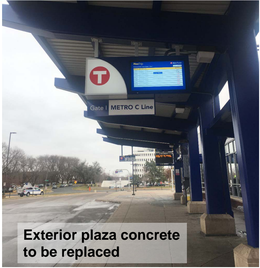
Exterior plaza concrete to be replaced