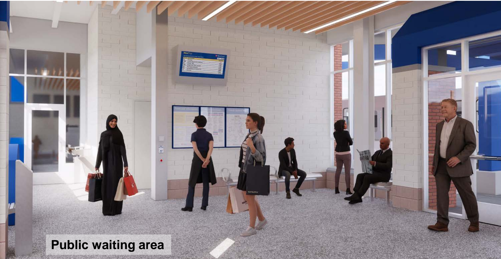
Public waiting area