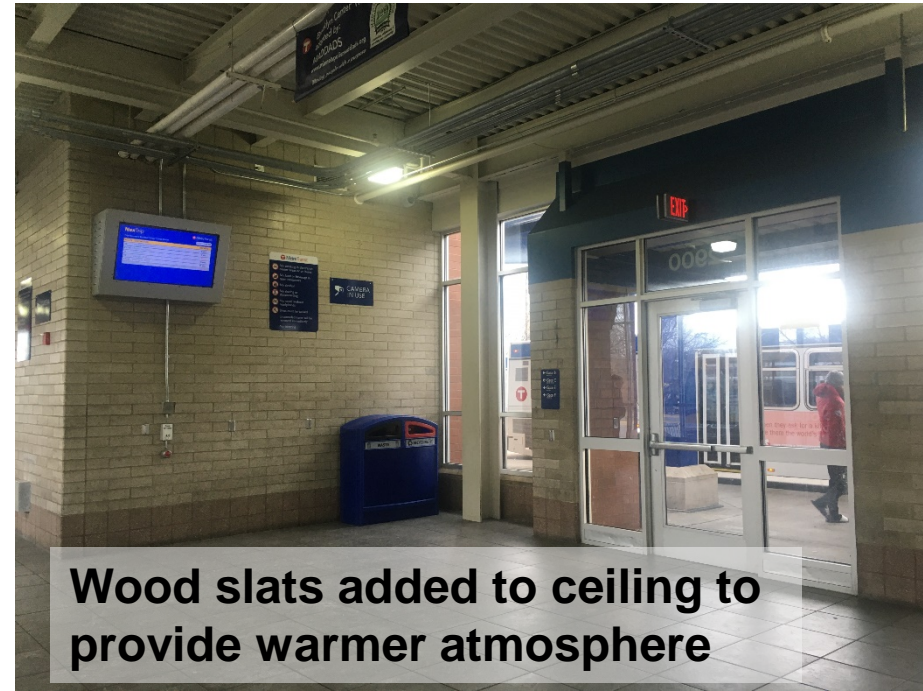
Wood slats added to ceiling to provide warmer atmosphere