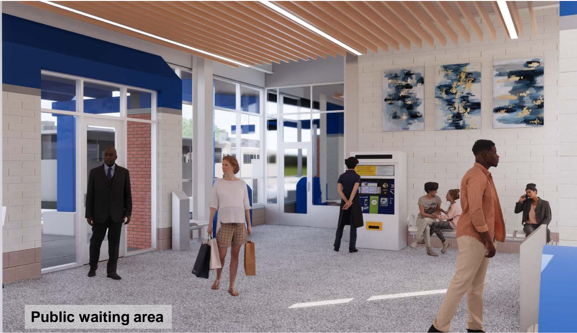
Public waiting area