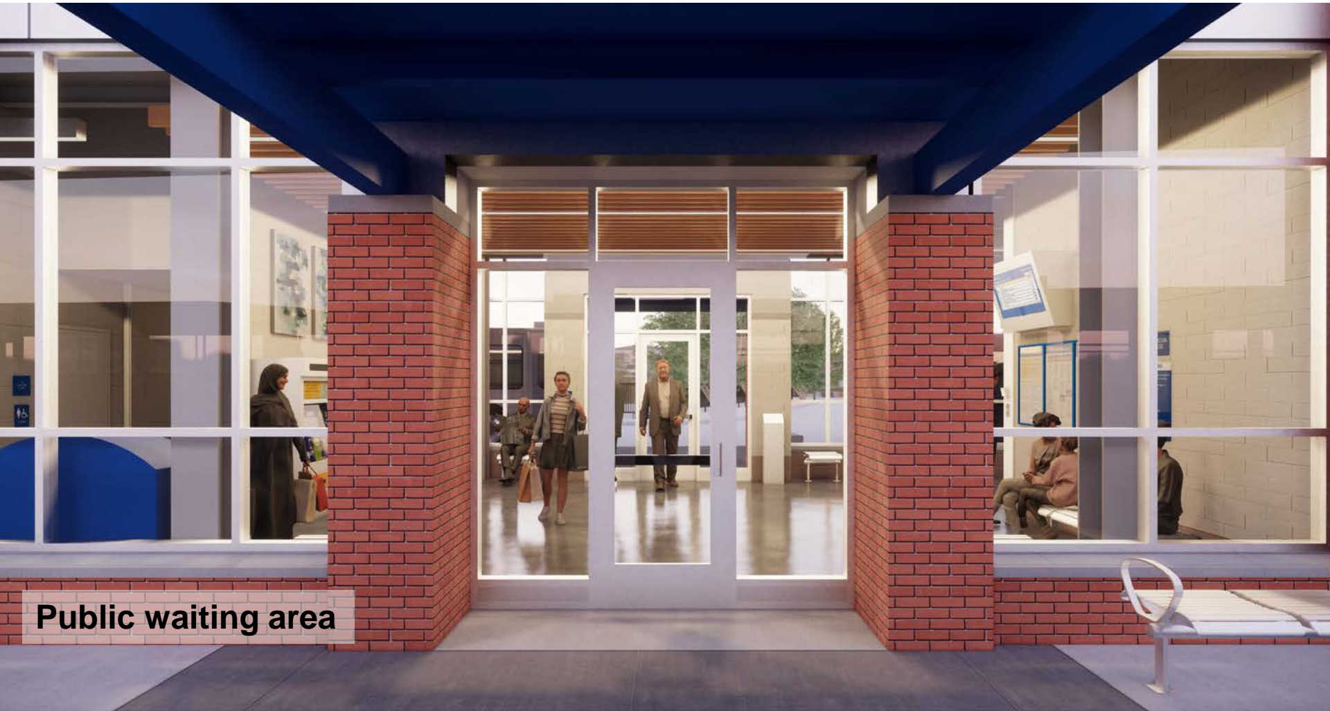
Public waiting area