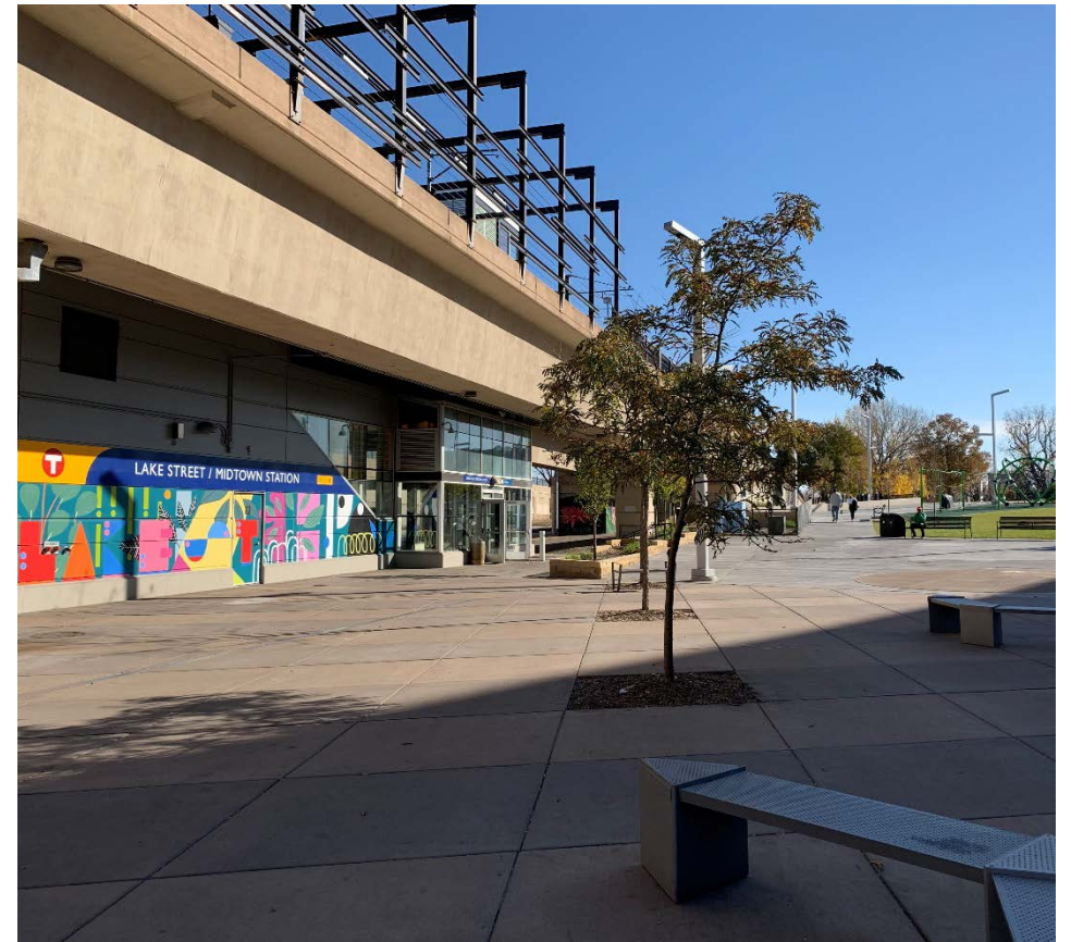
South entrance at Lake St/Midtown Station