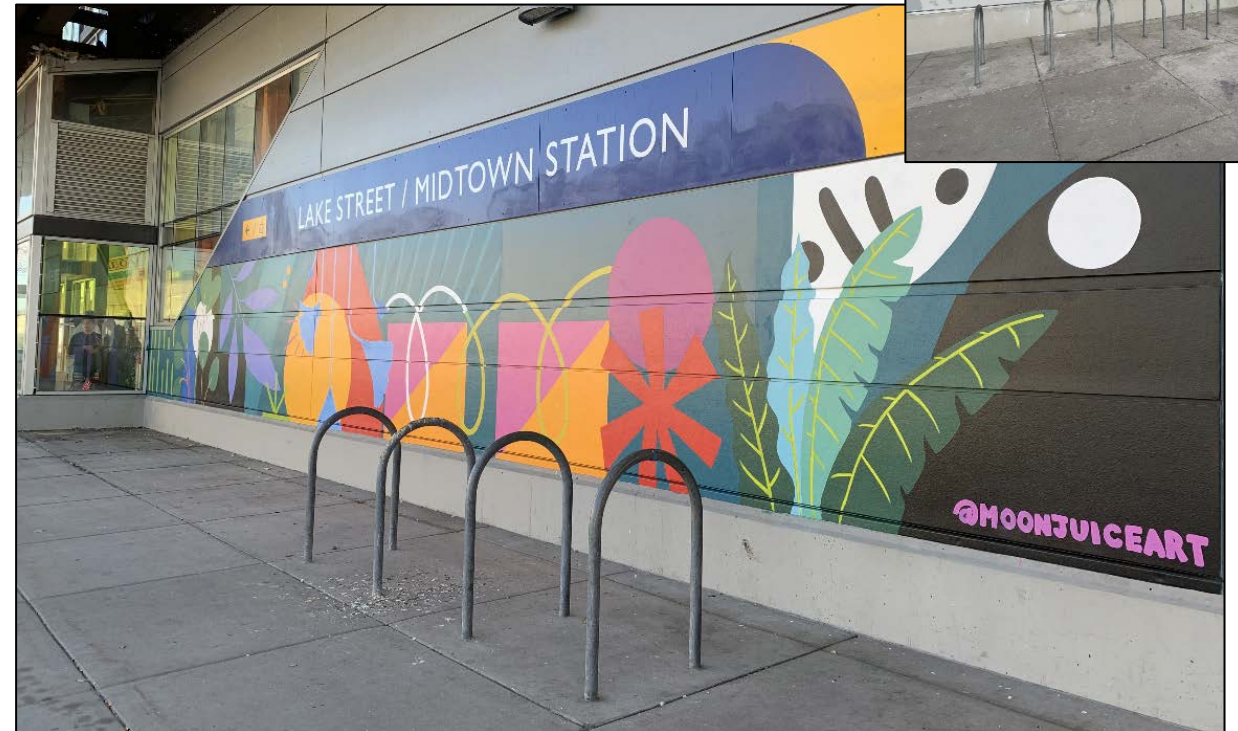
Façade damage from repeated graffiti removal (top right), replaced with a mural in Fall 2022 (above)