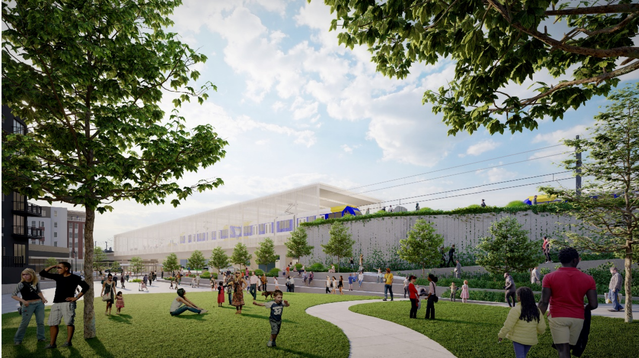
Street-level and Park View