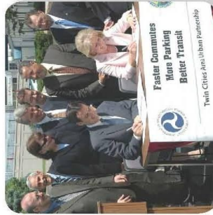
Figure 12-2: The UPA is one example of congestion management.

This Policy Plan sets a new direction and vision for the expenditure of funds on the Metropolitan Highway System emphasizing ATM applications, lower-cost / high-benefit projects and the implementation of managed lanes system-wide. It emphasizes that investments on the non-freeway trunk highway system sought by local entities should also be consistent with the policy direction of this plan. However, the Regional Solicitation for highway projects to date has to a large degree emphasized funding for expansion. This policy direction should be revisited to ensure that, in accordance with this plan and federal policy, adequate preservation investments are being made on the federally eligible highway system. The Transit chapter also emphasizes system preservation as the top priority, with additional revenue (when available) used to expand the bus system and grow the system of bus and rail