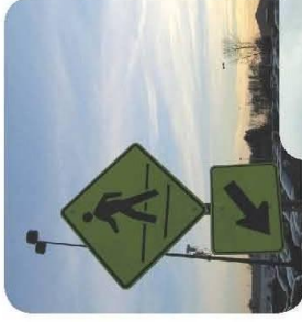
Figure 12-1: Non-motorized travel modes will play an important role in the region.

This project includes an inventory of existing and currently planned bicycle facilities in the seven county Twin Cities metropolitan area, followed by a Regional Bicycle System Master Study that will include