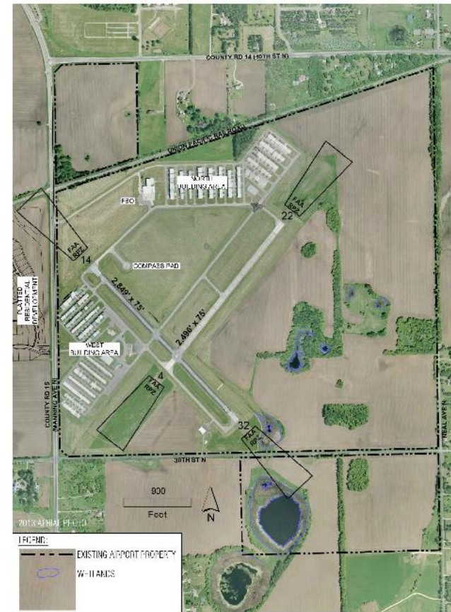
Figure ES-1: Existing Airport Layout