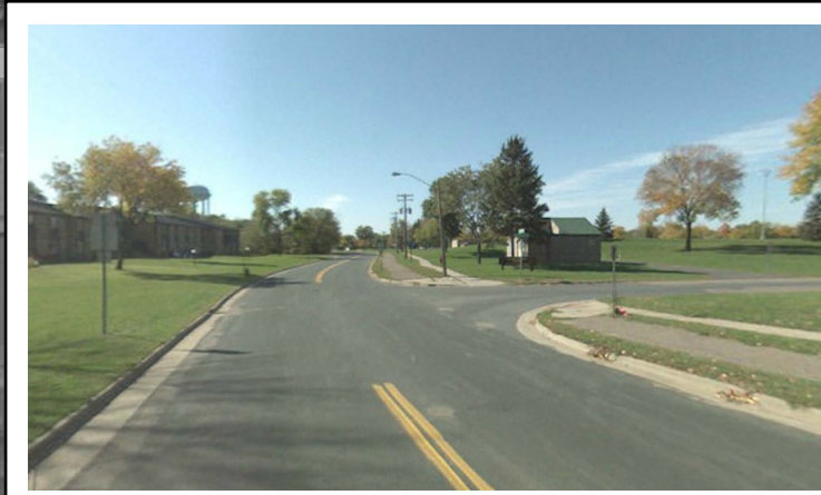
Install sidewalks on the south side of 70th Ave (left) and the west side of Camden Ave (upper right) to better serve students approaching from the east side of the school.