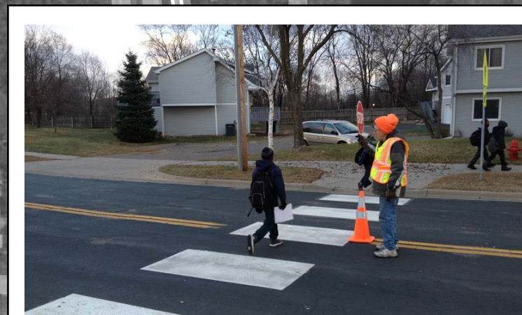
The location of this marked crossing on 70th Ave does not facilitate the current crossing behaviors of most students. Consider moving crosswalk to match existing crossing patterns or institute an education/enforcement program to shift behavior.