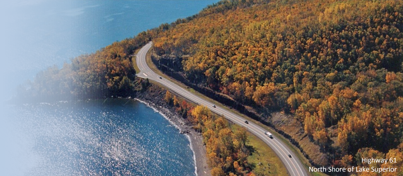
Highway 61 North Shore of Lake Superior

U.S. Department of Transportation (FHWA/FTA)