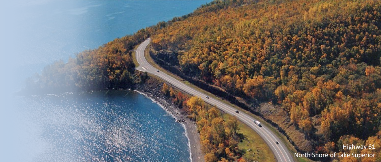
Highway 61 North Shore of Lake Superior

U.S. Department of Transportation (FHWA/FTA)