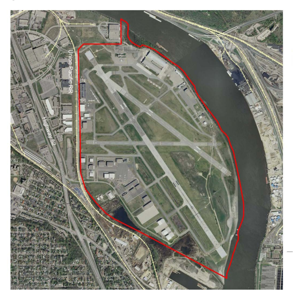
Figure 9-3: Downtown St. Paul Airfield