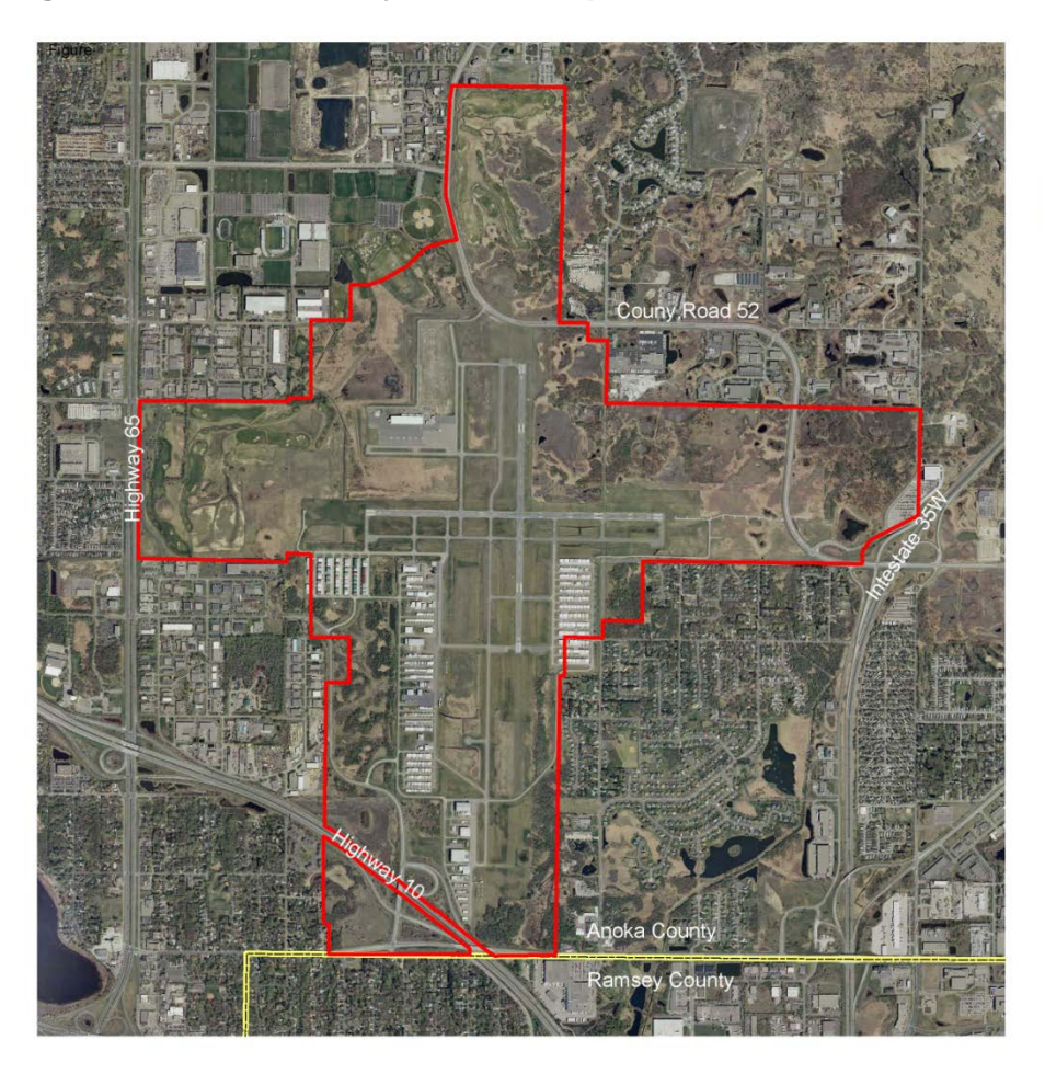
Figure 9-5: Anoka County – Blaine Airport