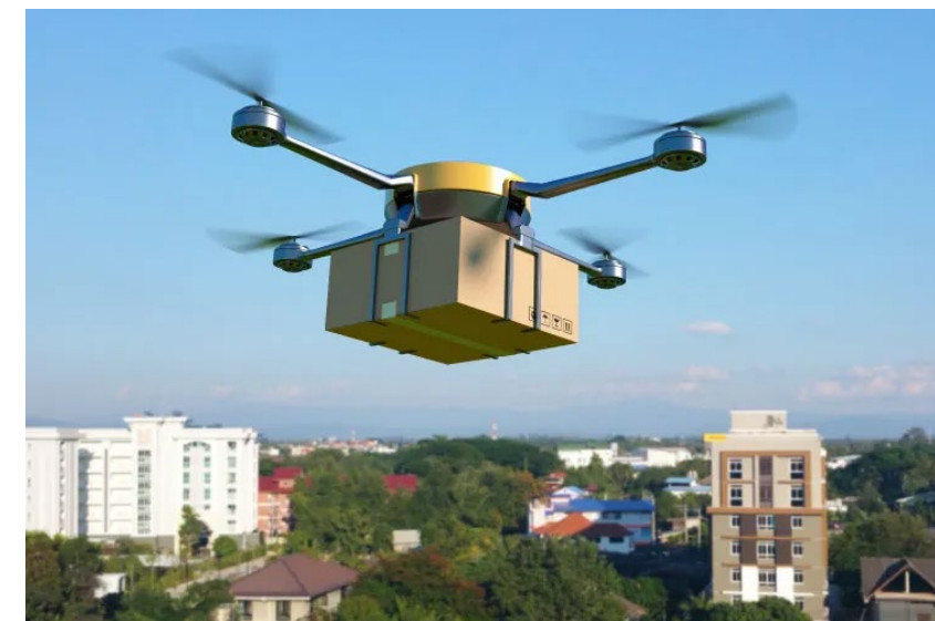
First Federal Aviation Administration Certification announced for commercial package delivery using drones April 25, 2019