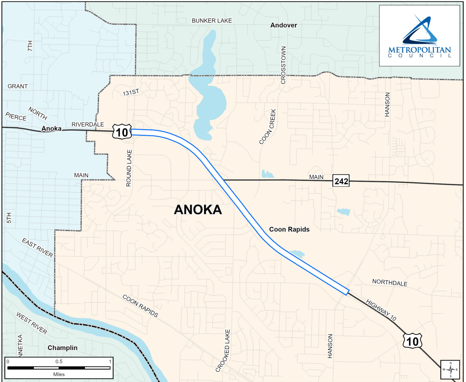
Extent of Main Map