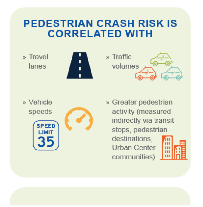
Figure 3. Pedestrian safety action plan systemic risk analysis findings (to be updated)

The systemic risk analysis key findings included: