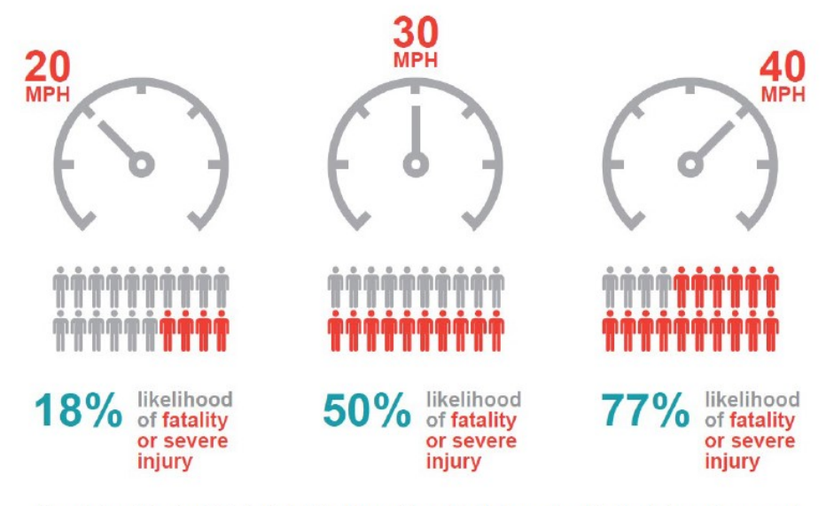
Figure 2: Impact Speed and a Pedestrian's Risk of Severe Injury or Death

Figure 2. Impact speed and a pedestrian's risk of severe injury or death