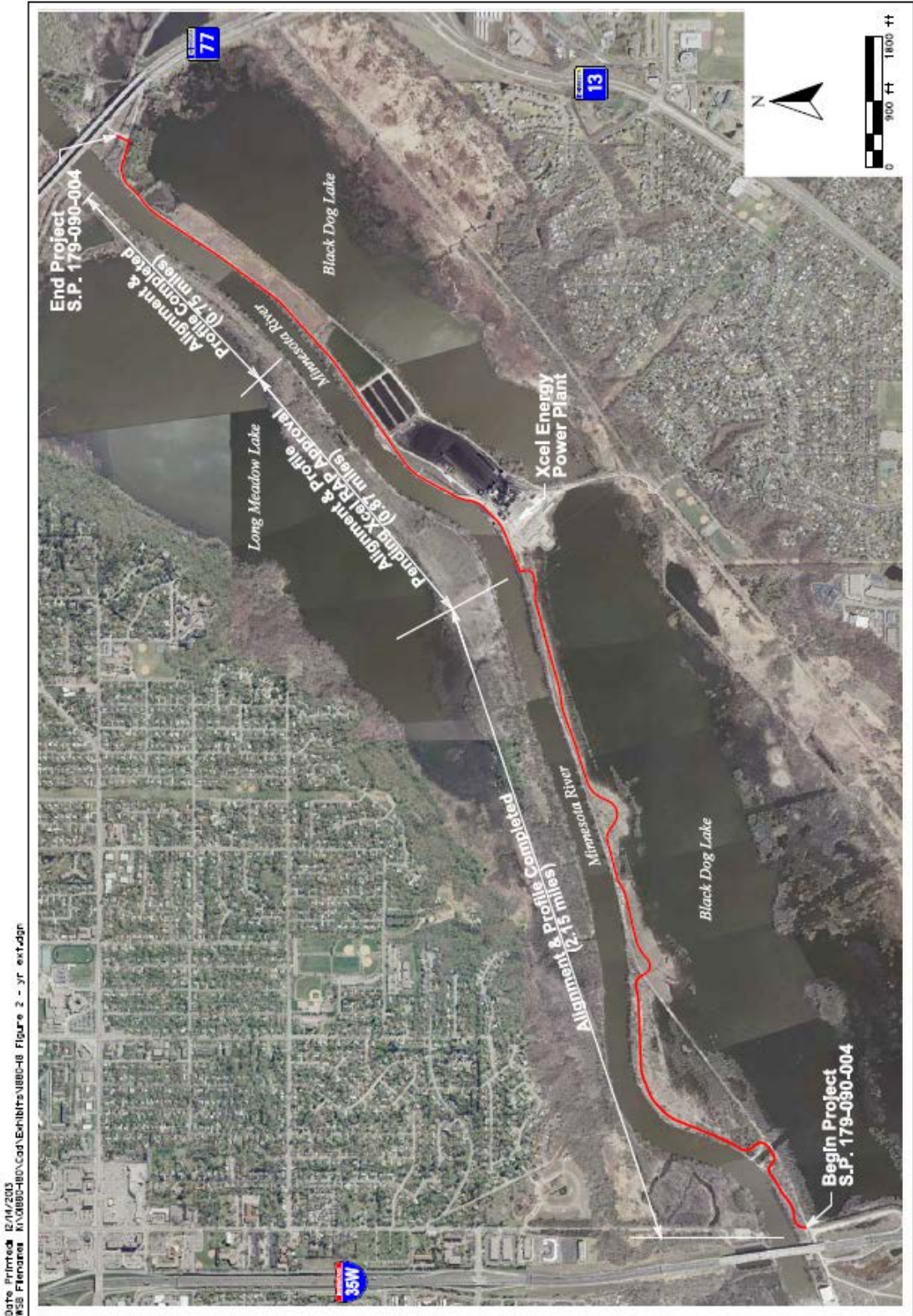
Figure 2: Project Layout

Date Printed: 12/14/2015 Path: F:\Projects\12\14\2015\179-090-004\Exhibits\1880-18 Figure 2 - yr_ext.dgn