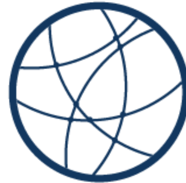
Cyber & Data Security