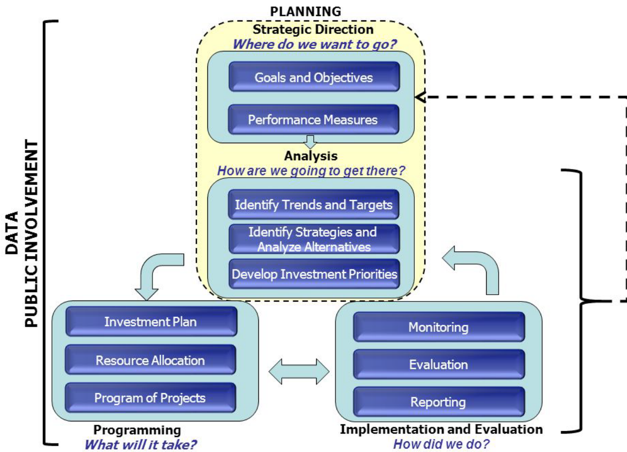
Figure 1-1 – Performance-based Planning Framework

Source: FHWA Performance-based Planning and Programming Guidebook, Page iv.