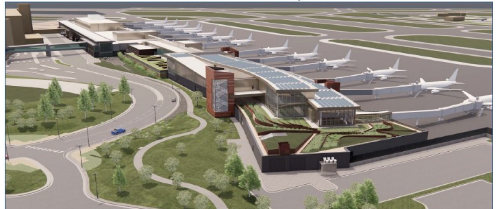
Rendering of the Terminal 2 expansion