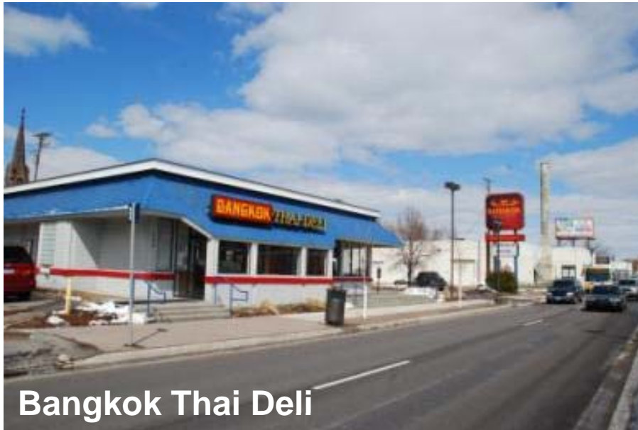
Bangkok Thai Deli