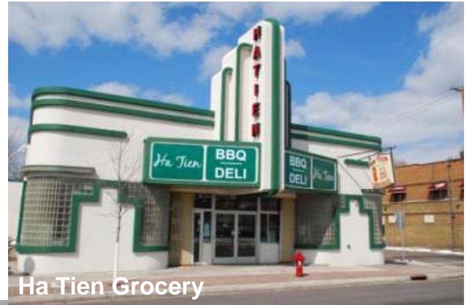
Ha Tien Grocery