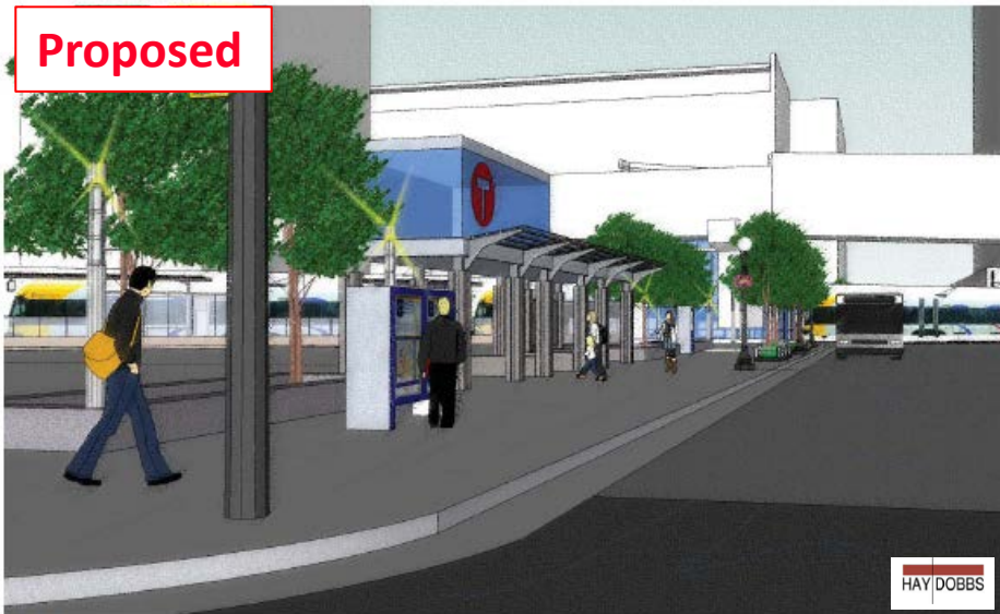
PERSPECTIVE LOOKING SOUTH TOWARDS 5TH ST. STATION