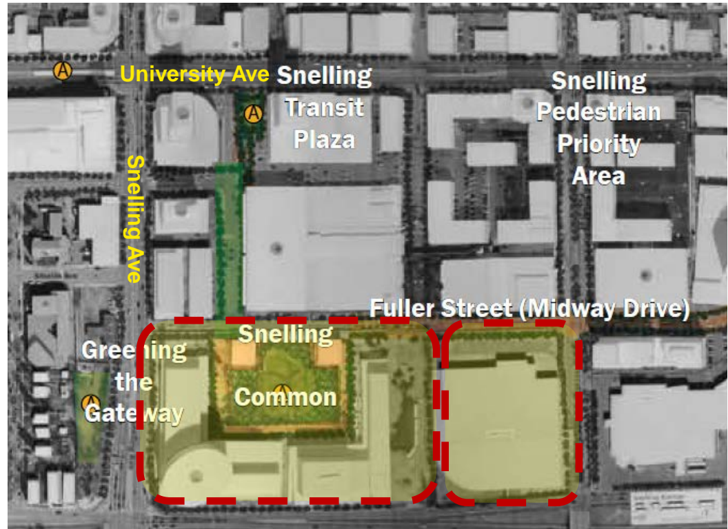
Redevelopment proposed in Snelling Station Area Plan.