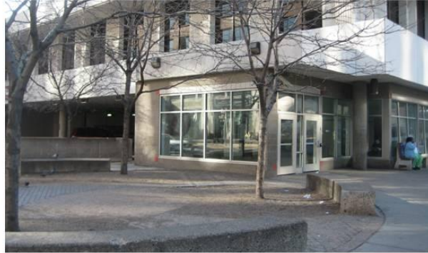
2. Exterior View of the Northwest Building Corner