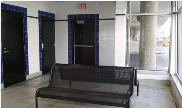
3. Interior View Looking to the South