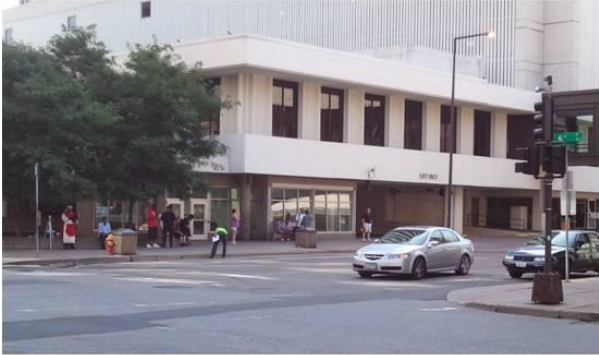
1. Exterior View Looking to the Southeast