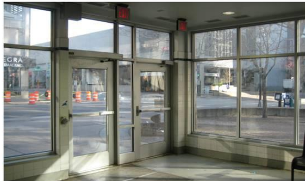
4. Interior View Looking to the Northwest