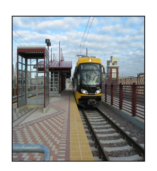
$ 1.6 billion