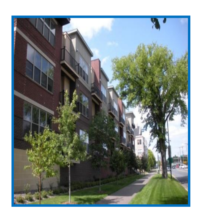
$ 5 billion