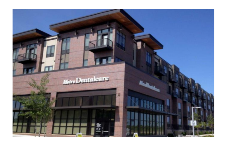
NorthStar TOD @ Ramsey Station