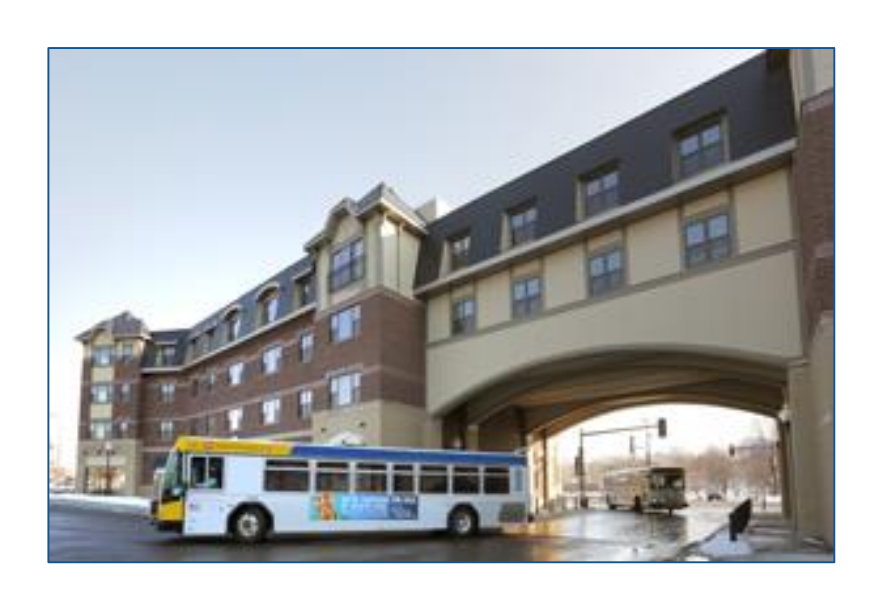
Blue Line TOD @ 46<sup>th</sup> Street Served by Bus Routes 7, 9, 46, 74, 84, 436, 446