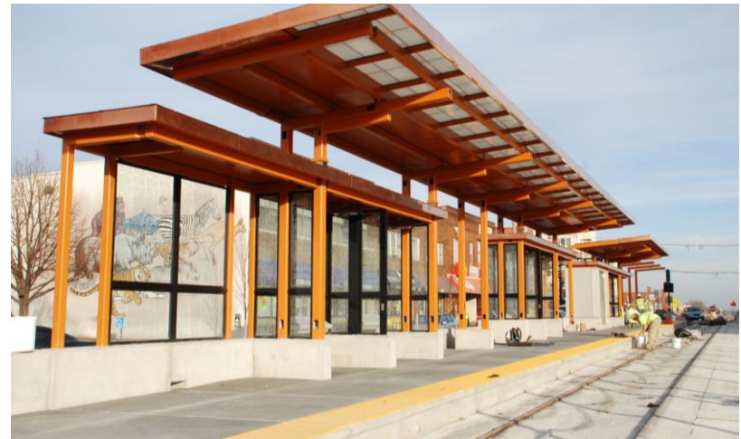
Green Line's Dale Street Station