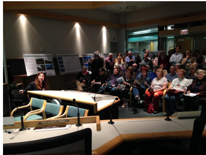
April 14 Hopkins/Minnetonka Open House