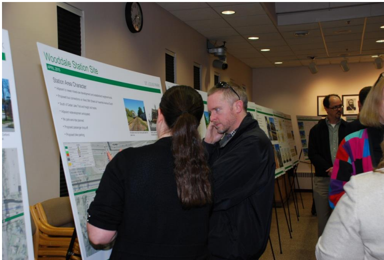
April 8 St. Louis Park Open House