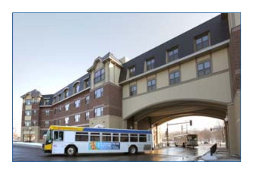
Blue Line TOD @ 46<sup>th</sup> Street Served by Bus Routes 7, 9, 46, 74, 84, 436, 446