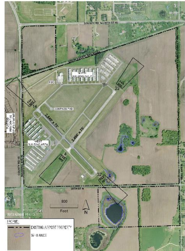
Figure ES-1: Existing Airport Layout