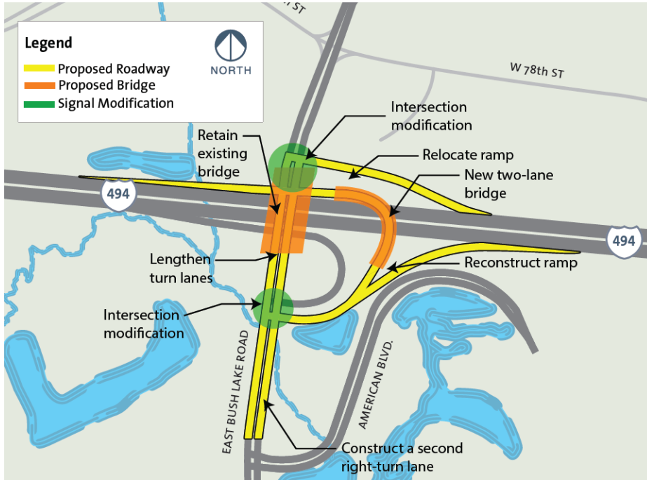
Figure 3: Project Improvements