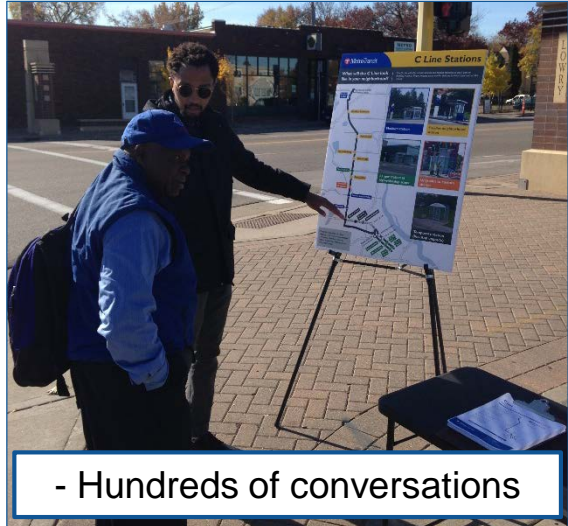
- Hundreds of conversations