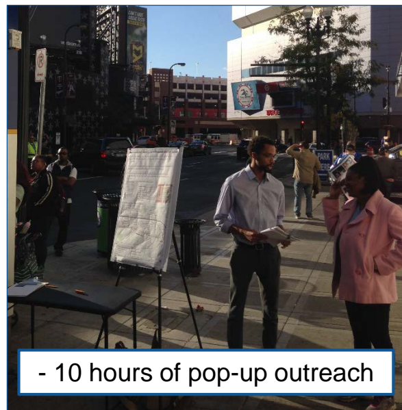
- 10 hours of pop-up outreach