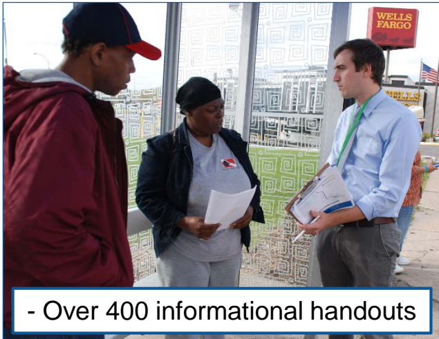
- Over 400 informational handouts