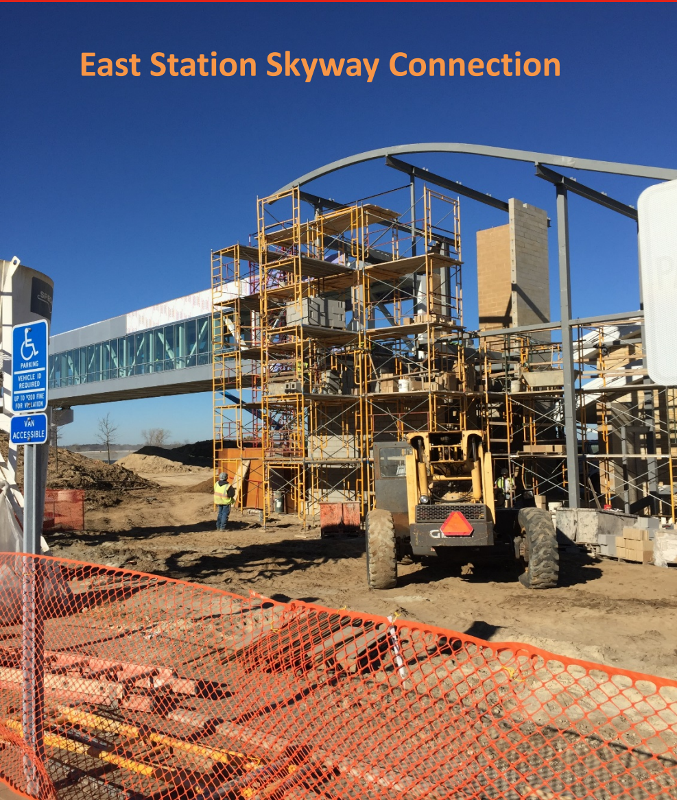
East Station Skyway Connection