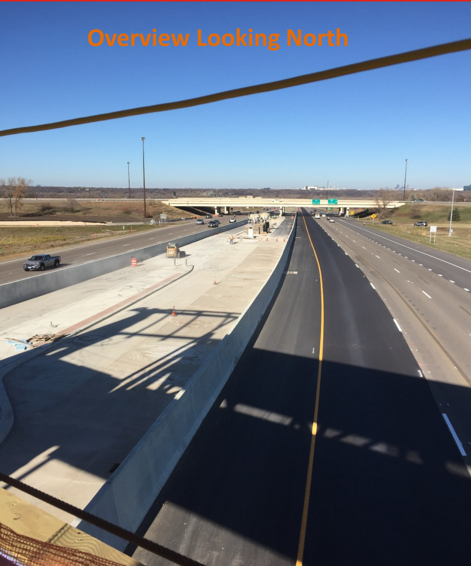
Overview Looking North