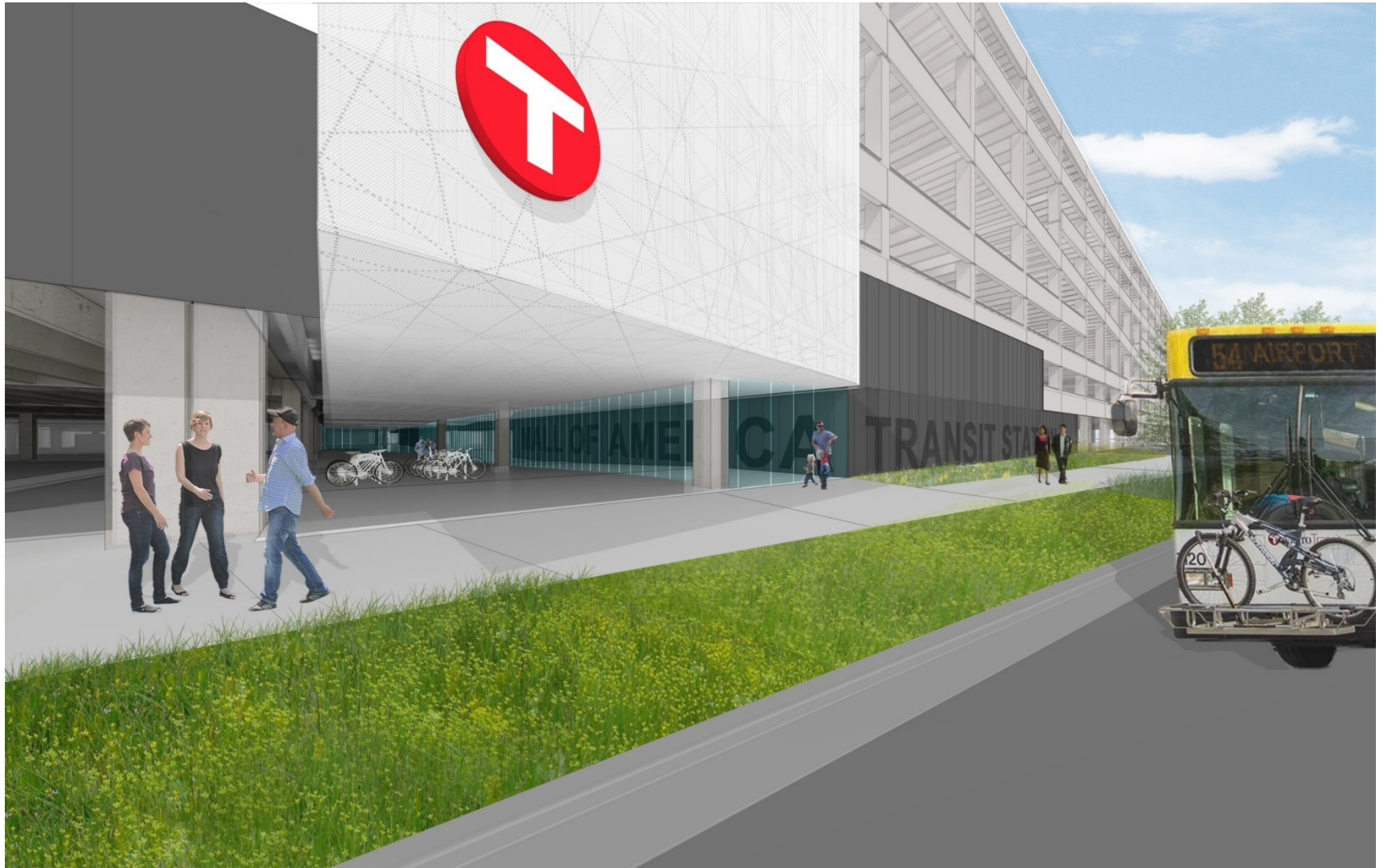
24 th AVENUE EXTERIOR VIEW OF TRANSIT STATION ENTRY – LOOKING NORTHWEST