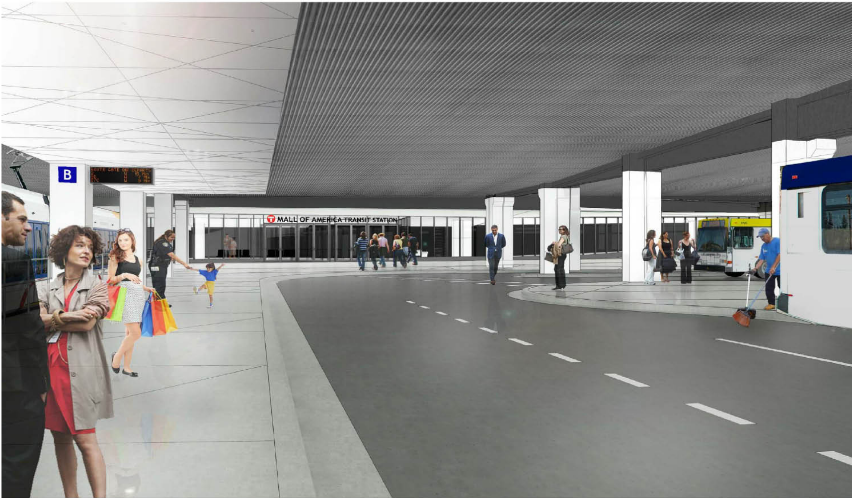
RENDERING - PERSPECTIVE FROM BUS LOADING ZONE LOOKING NORTH