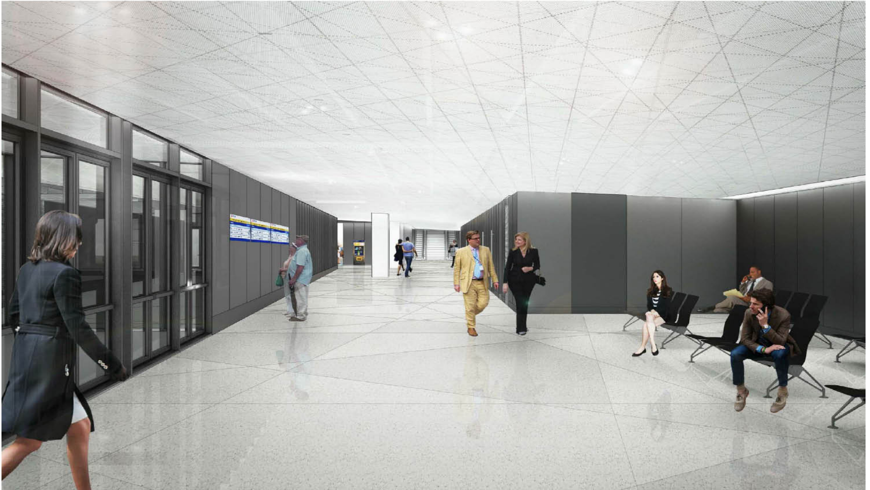
RENDERING - PERSPECTIVE IN TRANSIT STATION LOOKING WEST TOWARD MALL OF AMERICA