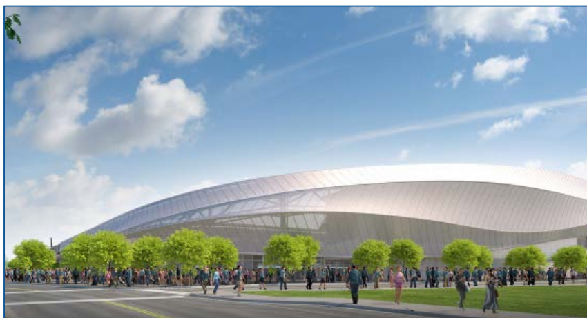
Undated rendering, circa Dec. 2016, of the exterior of Minnesota United FC soccer stadium, to be built in St. Paul. published in Pioneer Press December 12, 2016.