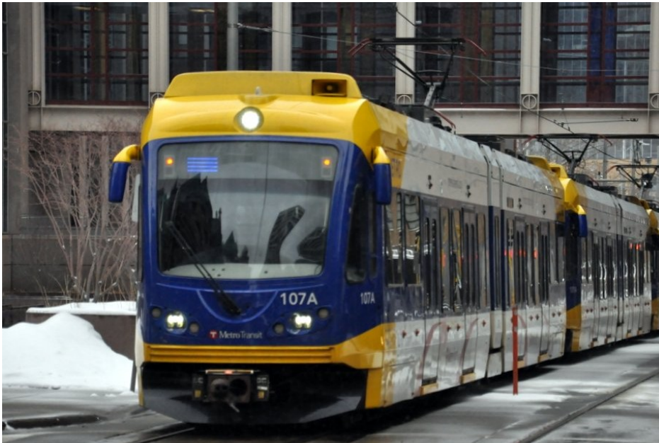
64 - Siemens S70 (Type 2) LRV's