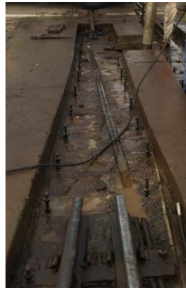
Crossover Casting Replacement