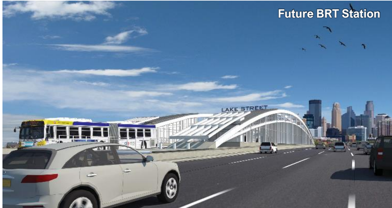
Future BRT Station