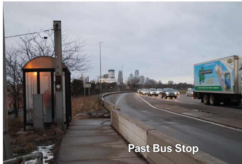
Past Bus Stop