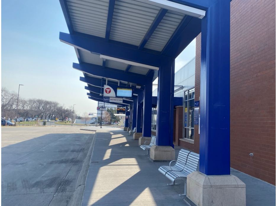
New LED lights on canopies, new seating