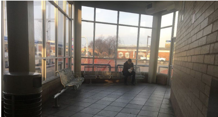
Public waiting space