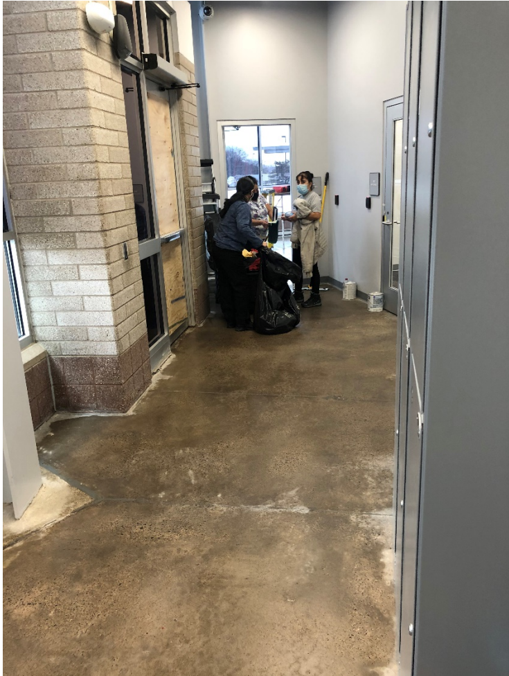
Everest - Cleaning