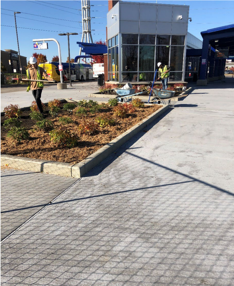
Plant Pros - Landscaping