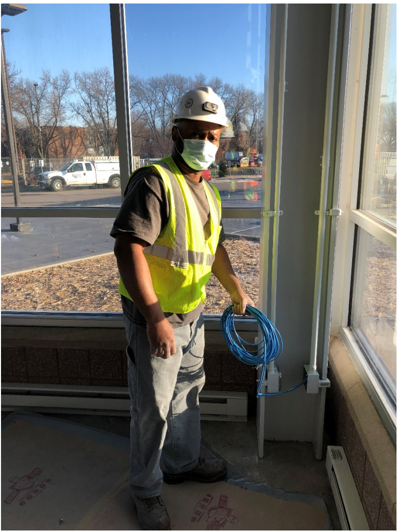
Tricom Communications – Communications