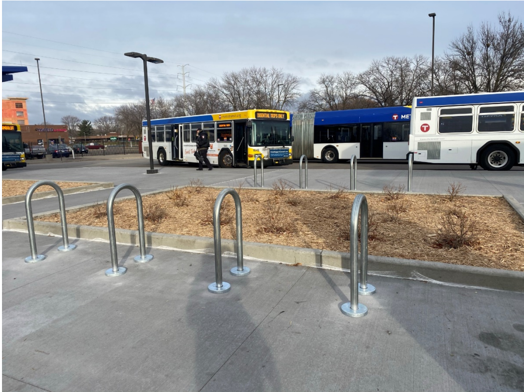
Plantings, bike racks