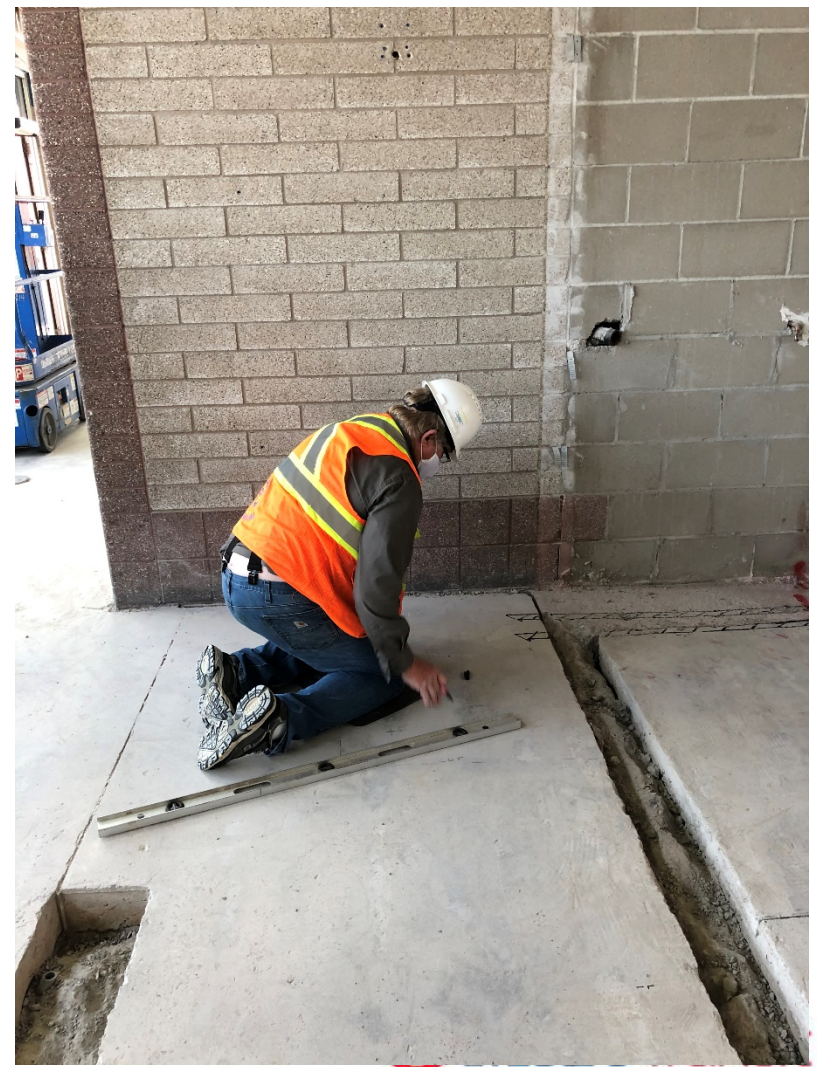
Sun Mechanical - Plumbing