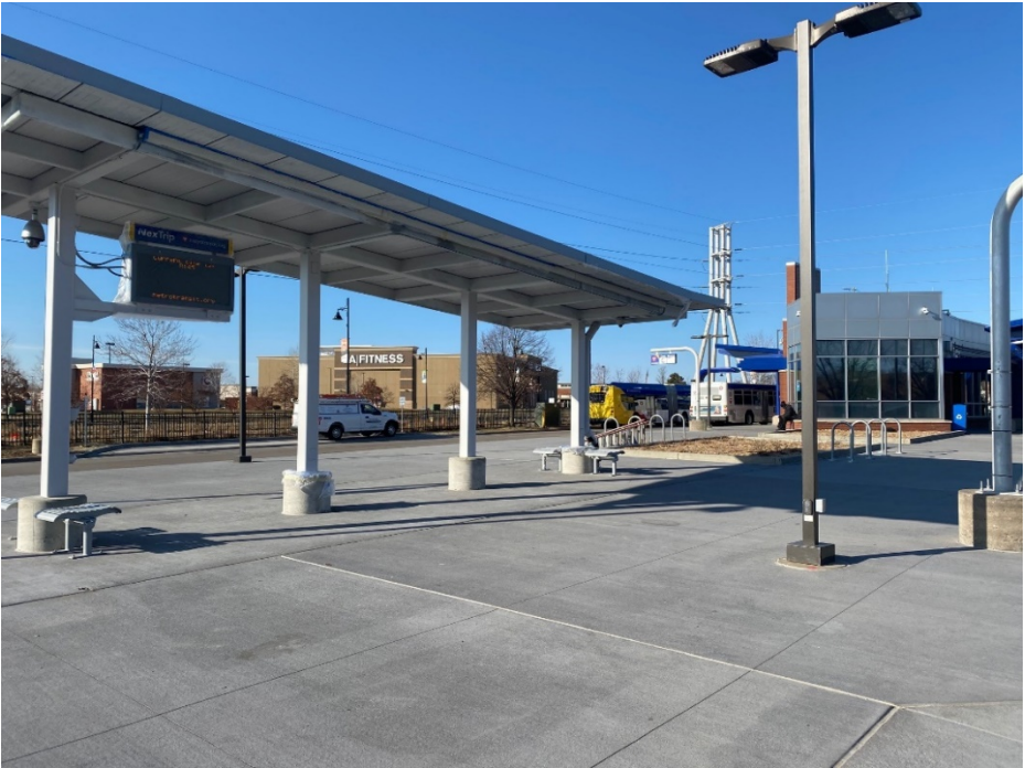
New canopies on each end, completed sidewalk