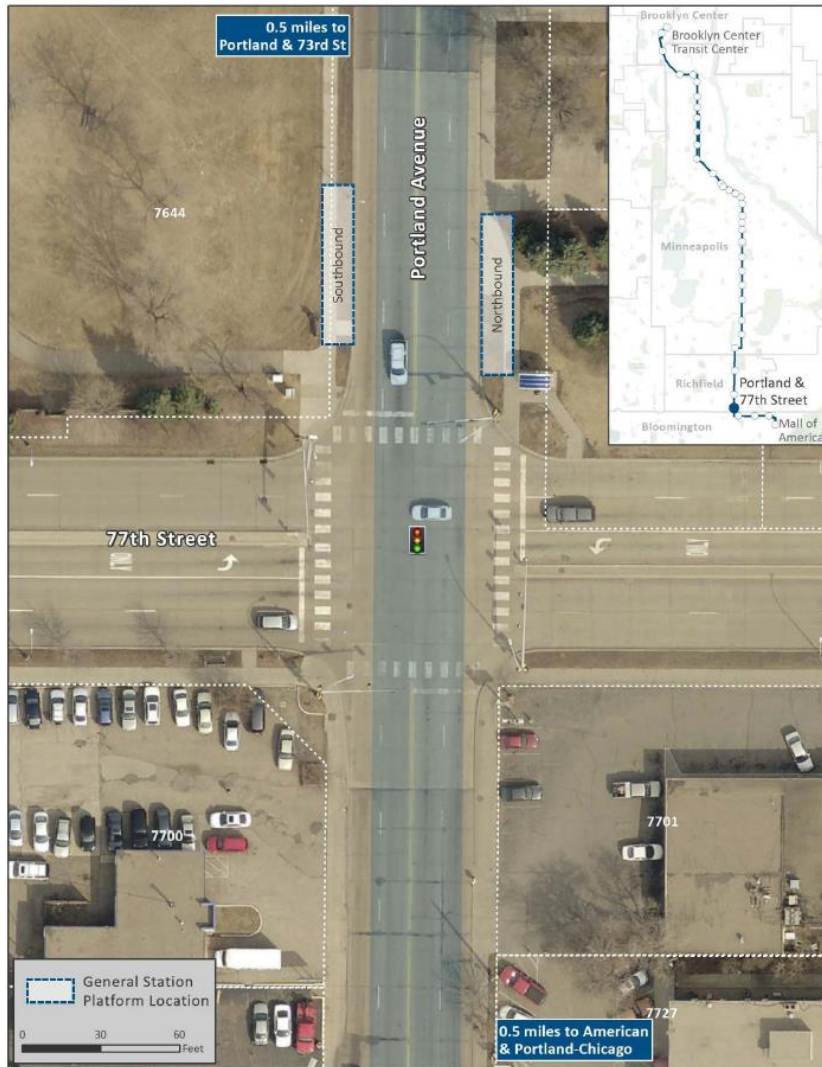
Approved Portland & 77th Street Station