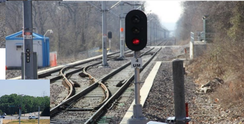
Signal at Interlocking – Blue Line