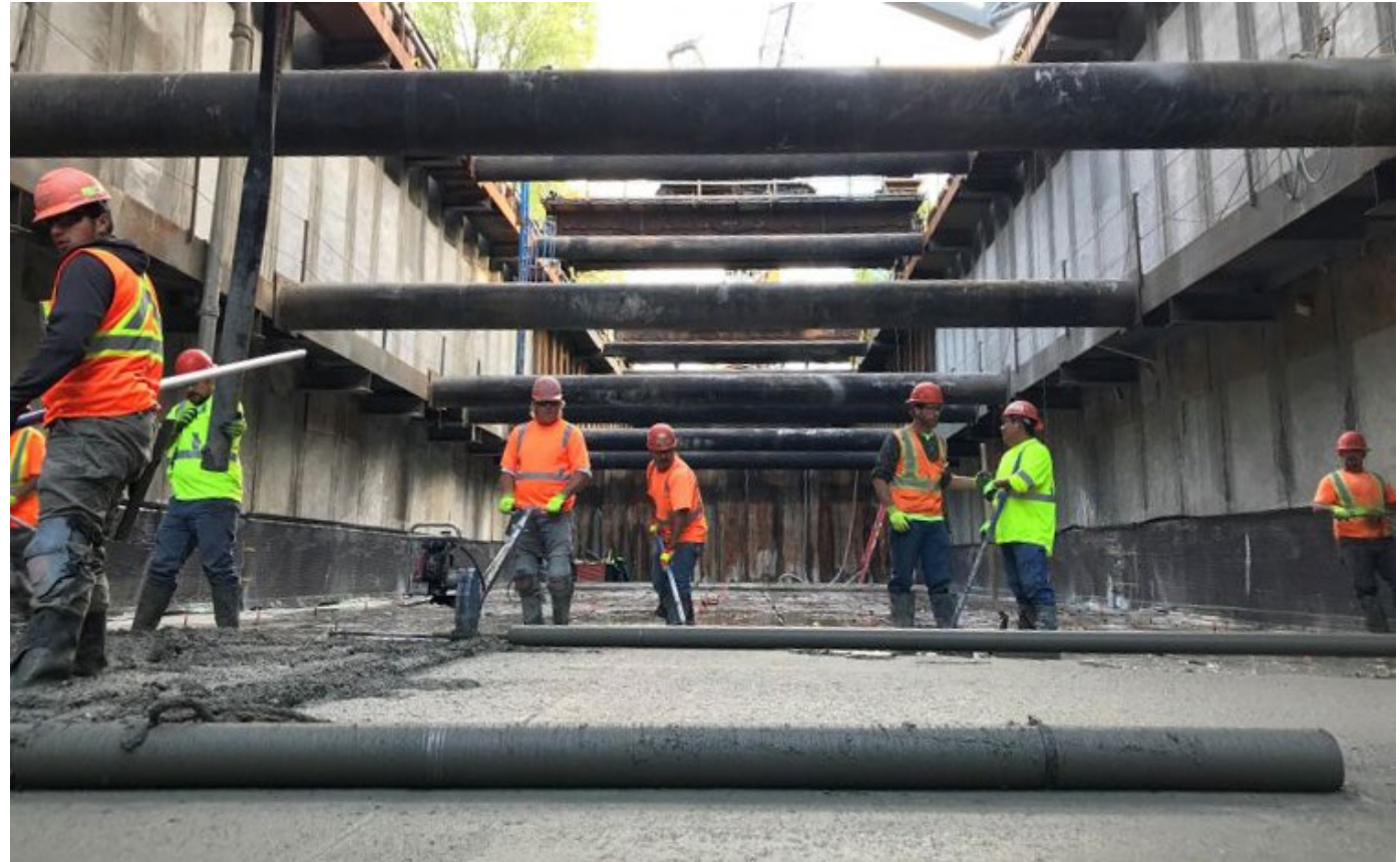
Crews pour the Kenilworth LRT tunnel leveling slab