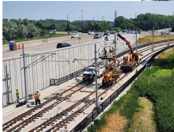
Overhead Contact System - Wire Installation near SouthWest Station