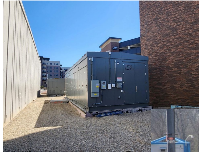
Traction Power Substation near SouthWest Station