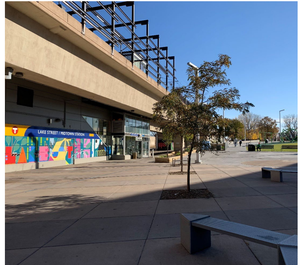
South tower entrance at Lake St/Midtown Station