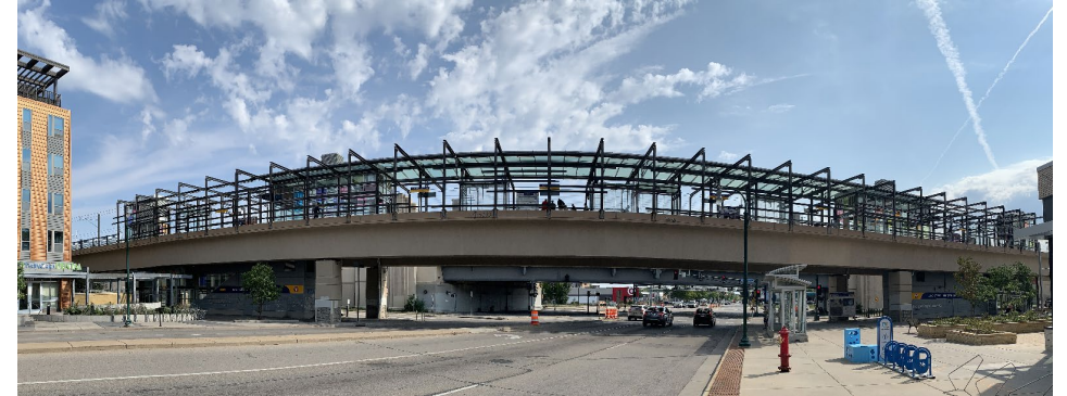
Platform over Lake Street, with towers on both side of the street