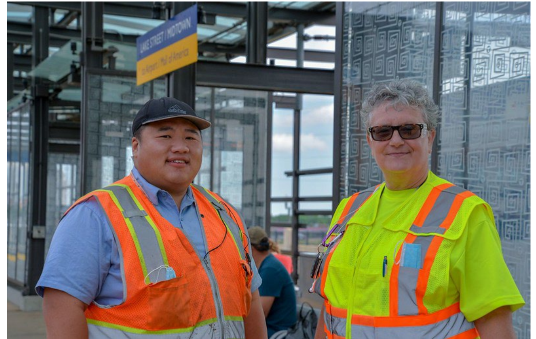
Facilities workers on the platform at Lake St/Midtown Station