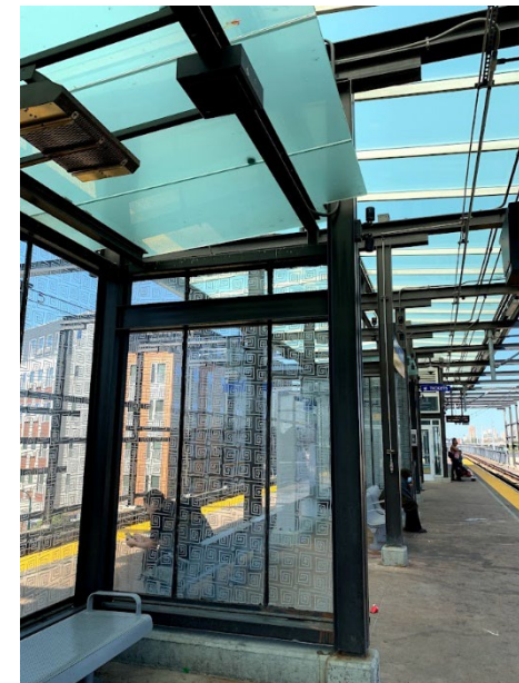
Existing shelters on platform