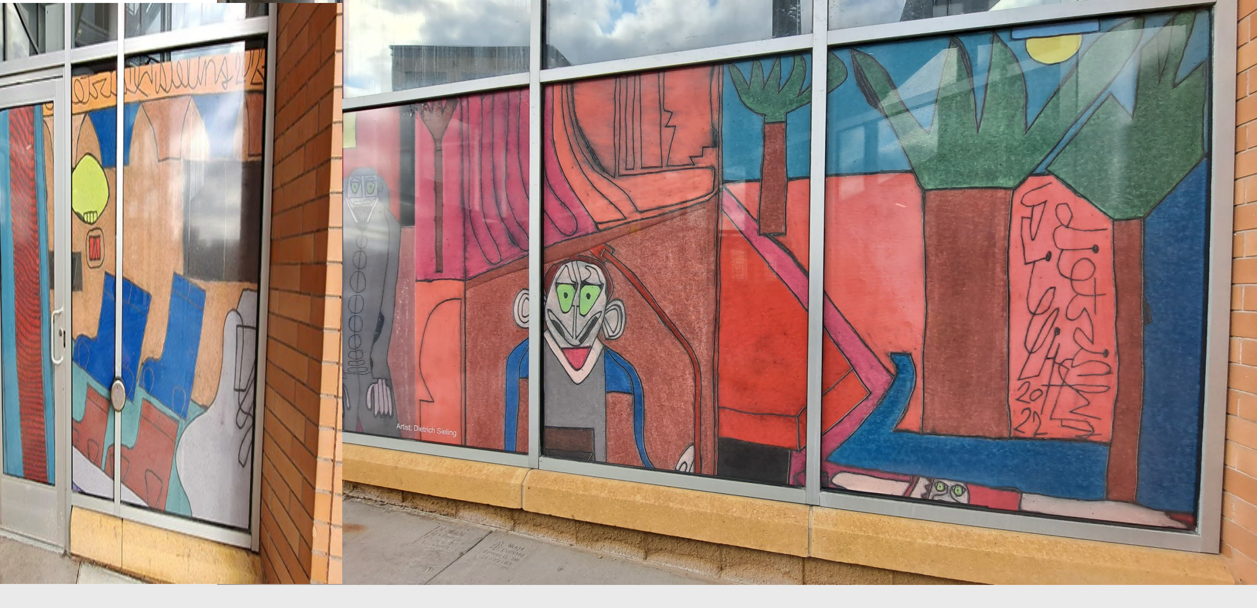
Smith Avenue Ramp