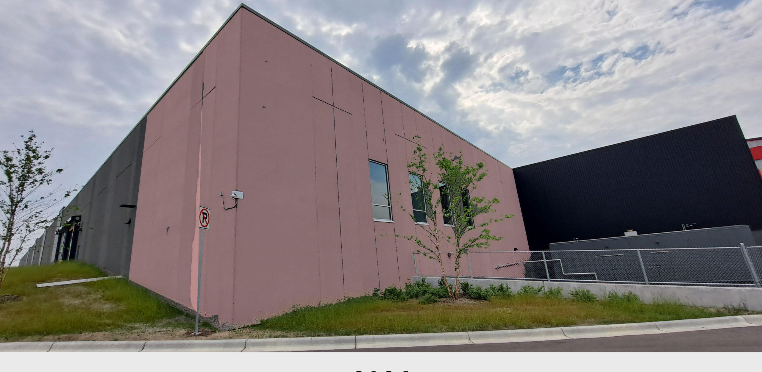
2024 North Loop Garage