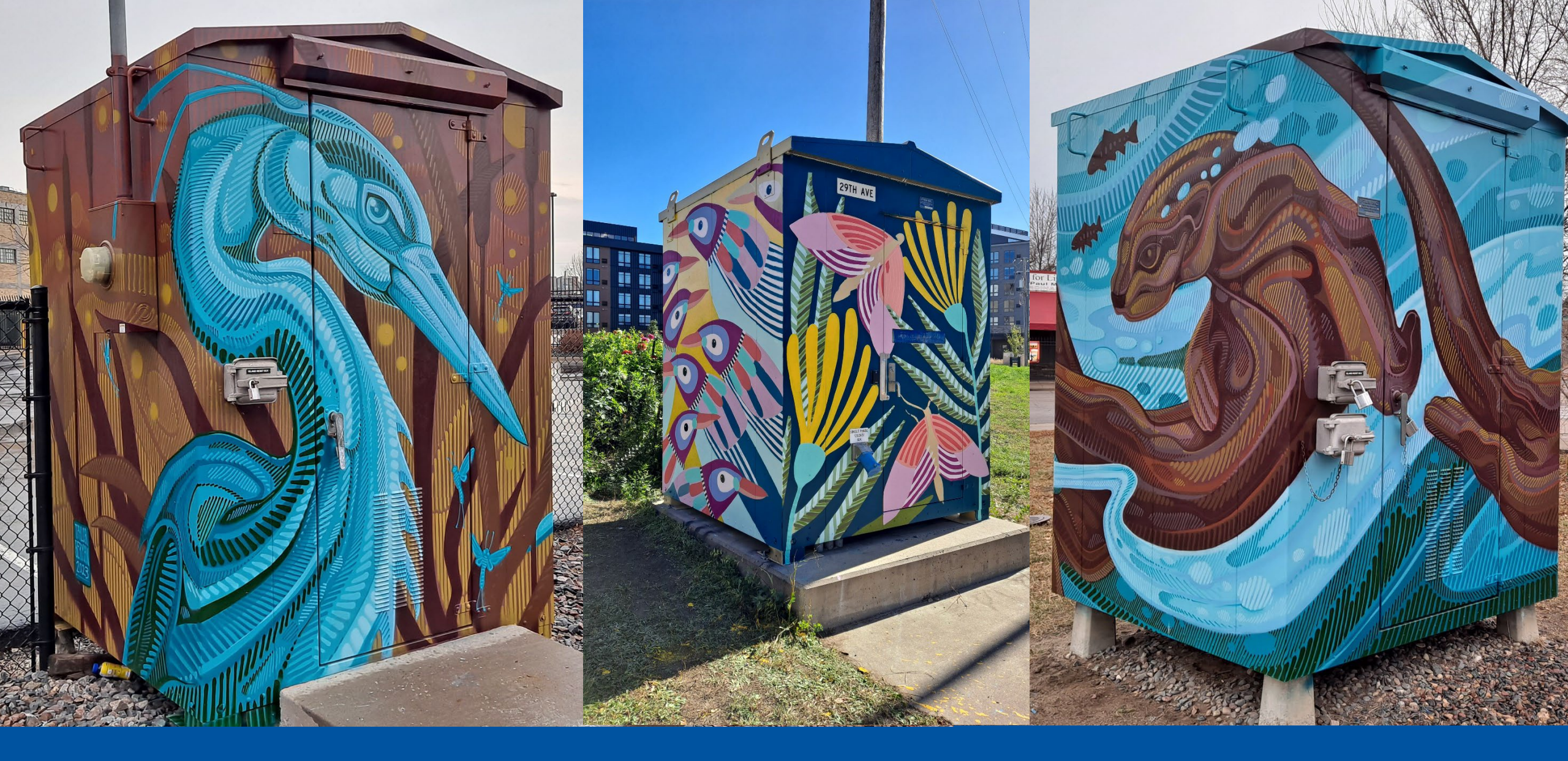
2023 Facilities Maintenance Support Crossing House Murals