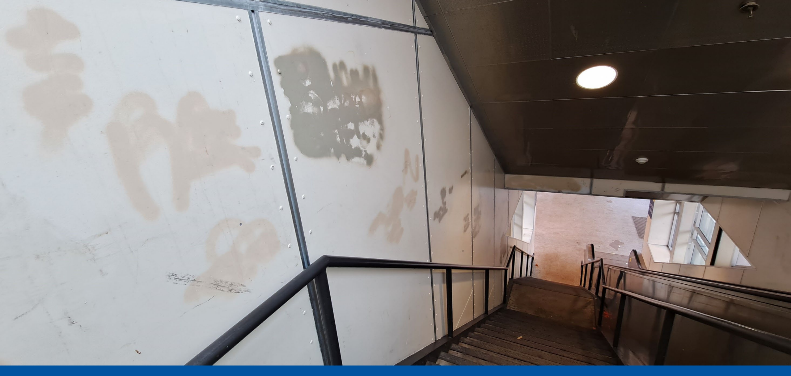
Anti-Graffiti Wallpaper Lake Street Midtown Station