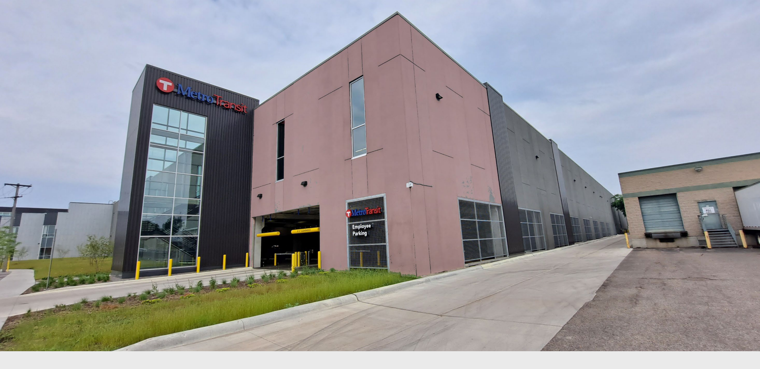
2024 North Loop Garage