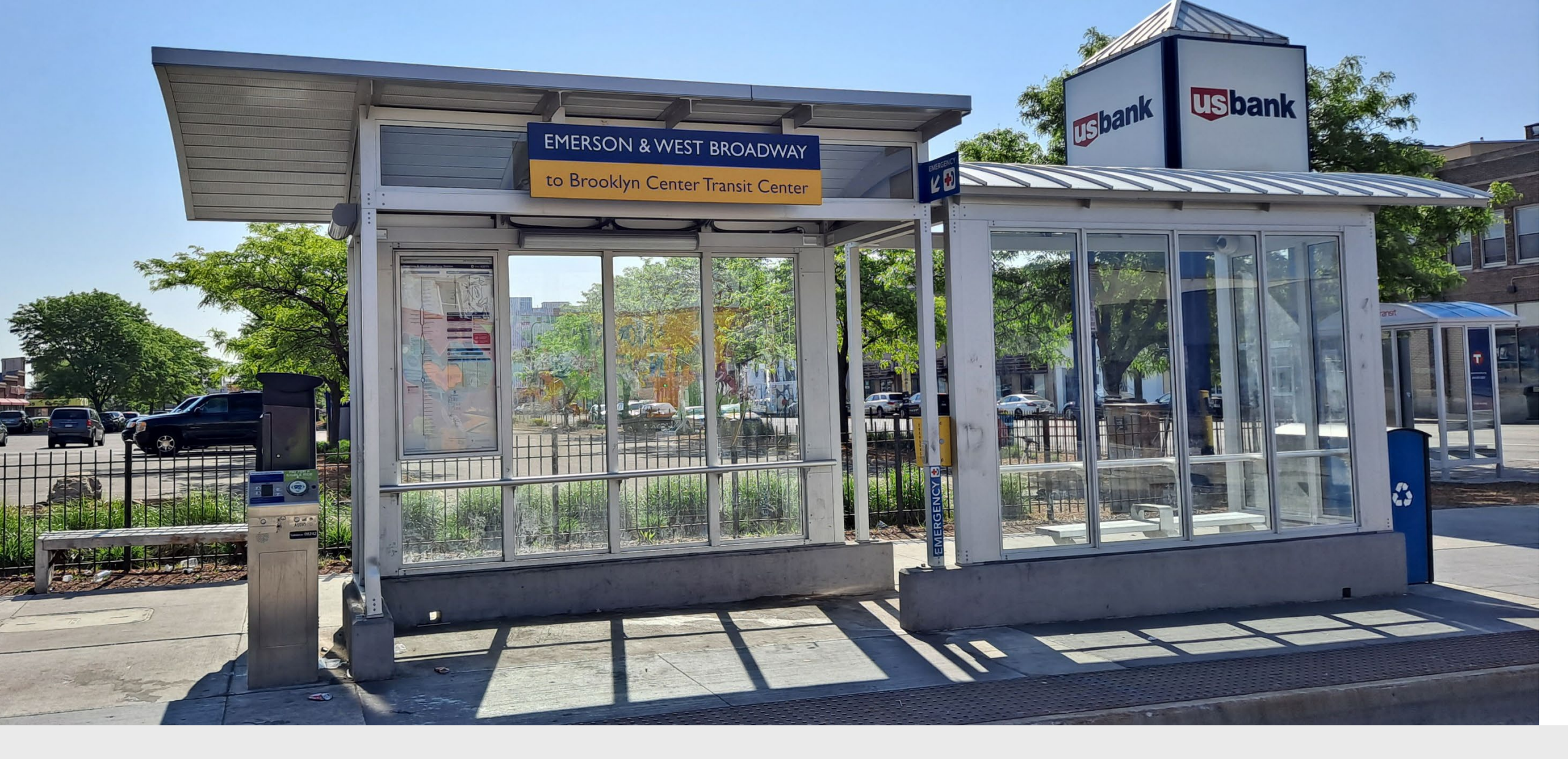
Walker Art Center & Juxtaposition Arts Partnership North Minneapolis D Line Shelters