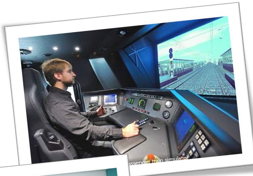
Light Rail Training Simulator