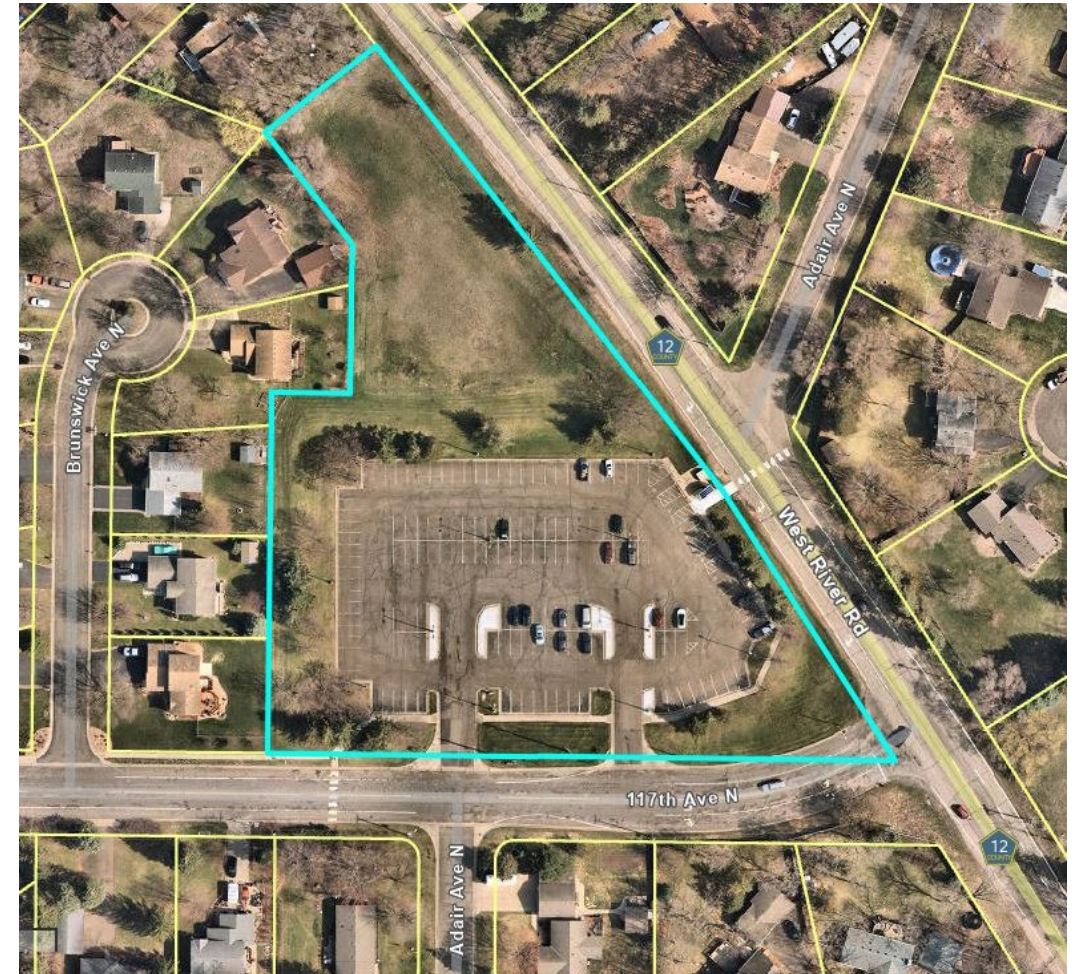
Parcel outlined for former Champlin Park & Ride