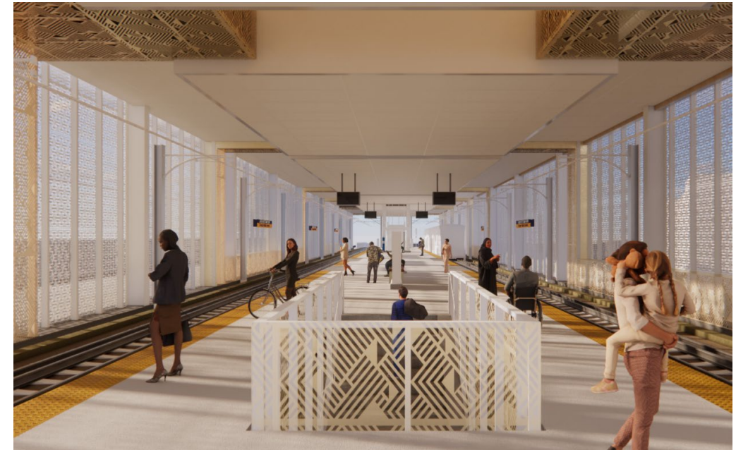
A new canopy and open-air platform will allow for clear sightlines and better circulation, responding to needs identified in planning and concept design